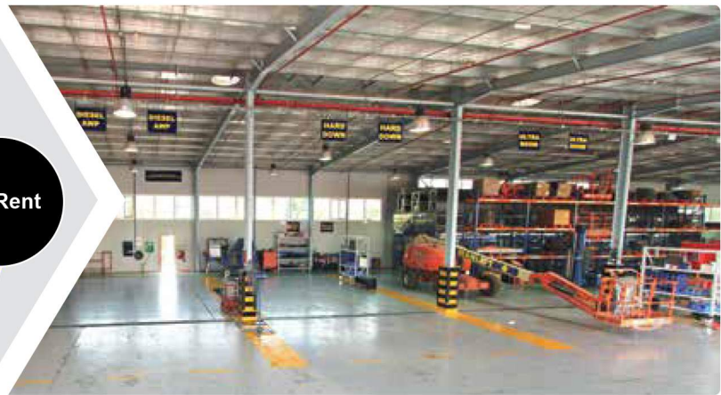
Workshop - Dubai, UAE