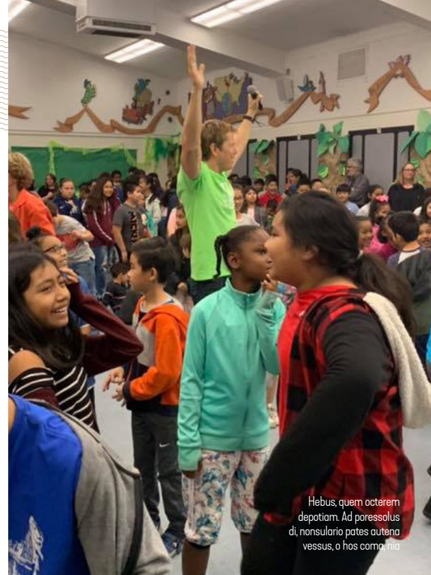
Hebus, quem octarem depotam. Ad porestulus di, nansulario pates autena vessus, o hos com...