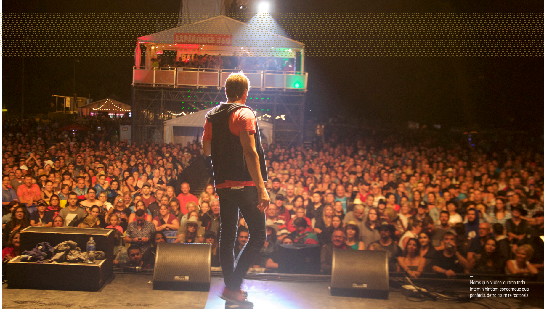
Nams que cludeo, quitrae tarbi intem nihintiam condemque qua pontecis, detra atum re factoreis