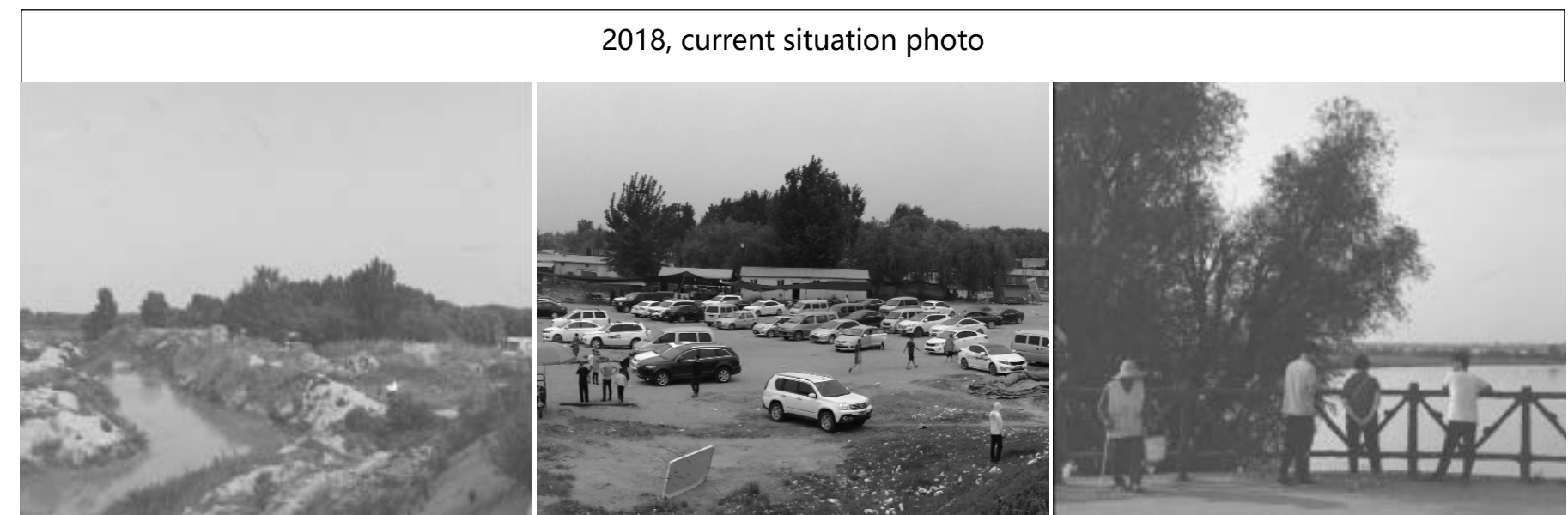
2018, current situation photo