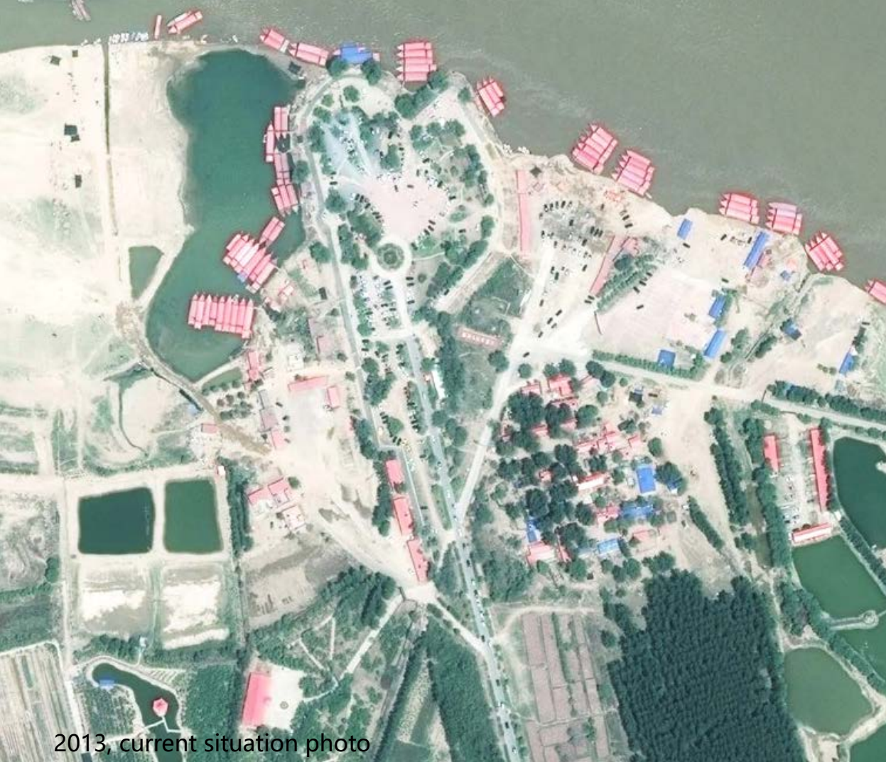
2013, current situation photo

Unique scenery, fishing boats, but at the same time ecological destruction