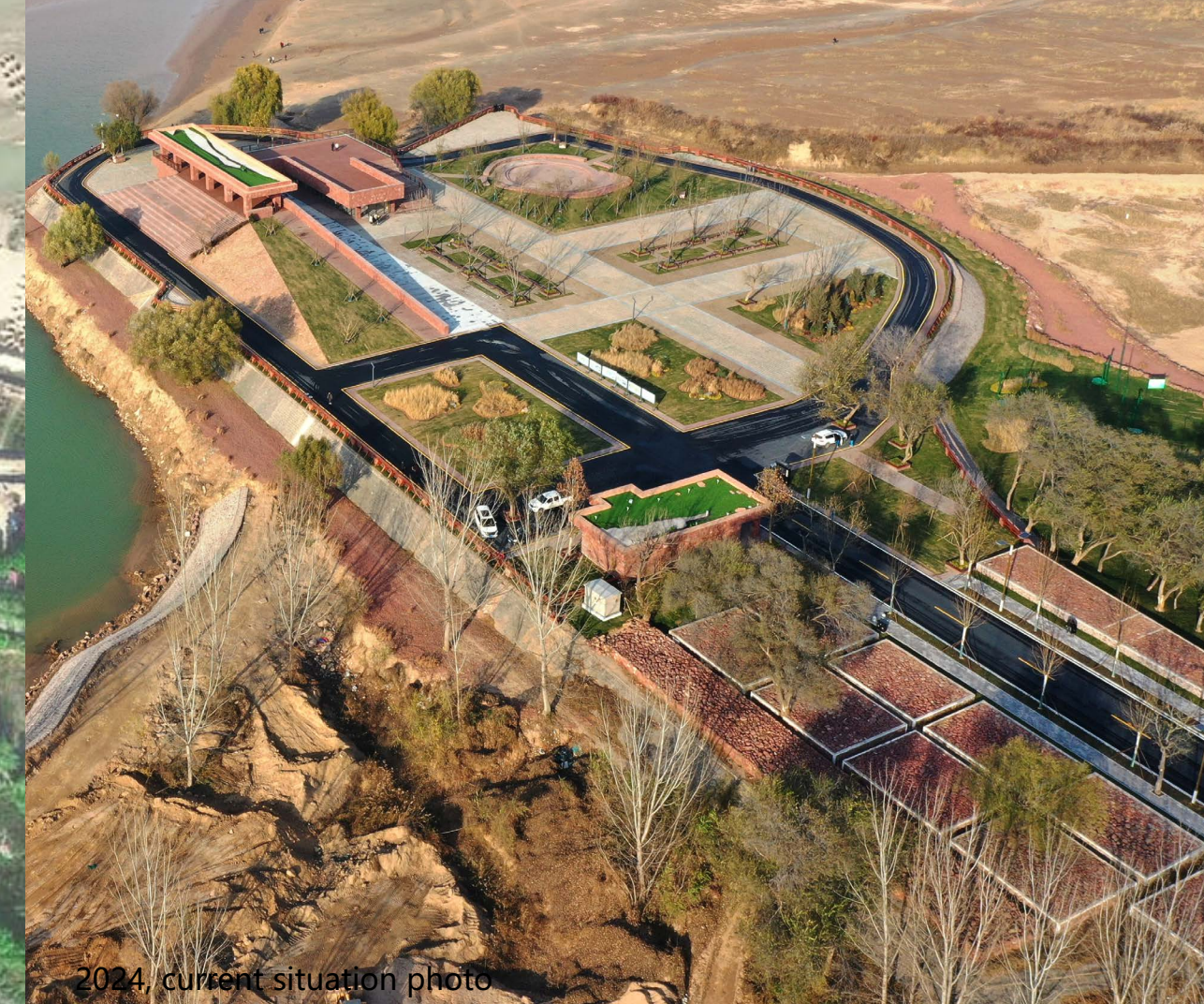
2024, current situation photo

Commercial operations were banned and ecological restoration was carried out in Nanbaotou