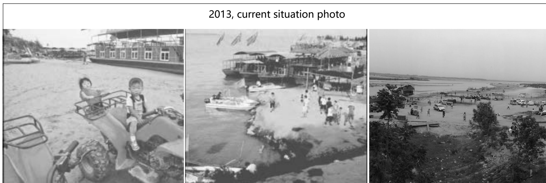
2013, current situation photo

The vegetation is green, the ecology is restored, and the scenery of the river can be seen on the stage