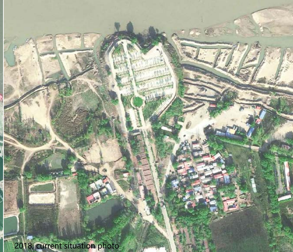
2018, current situation photo

Unique scenery, fishing boats, but at the same time ecological destruction