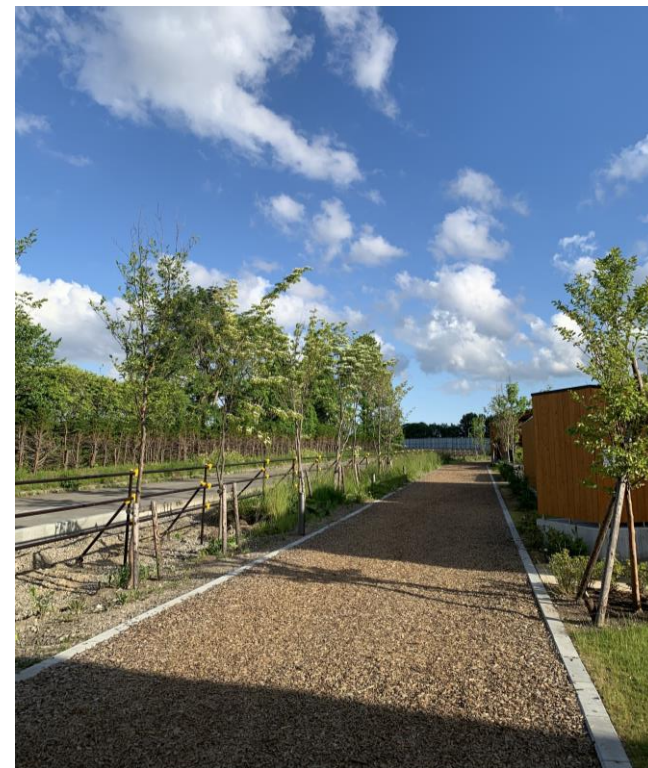
A pedestrian path is built outside the site to connect the surrounding roads. The loose material of pavement as wood chips not only makes visitors feel cosy but also ensures that rainwater can infiltrate into the ground.