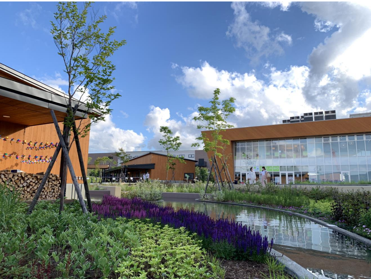
Flowers and water flow in the garden leading the sight from the entrance to the back of the site. The surface of the water reflects the season change and time flow.