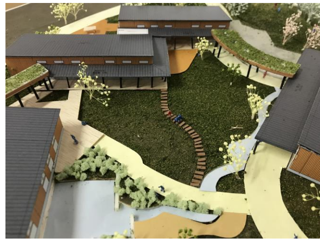
Gangi connects buildings to make it easy to move around and use the inside and outside even in bad weather.