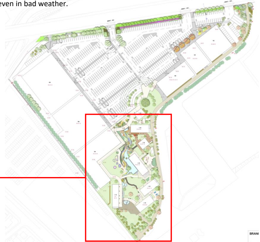
The park is accessible from various directions from the residential area by emphasising connecting to the surrounding road network. It can be used by locals and shoppers, including students commuting to schools and pedestrians.