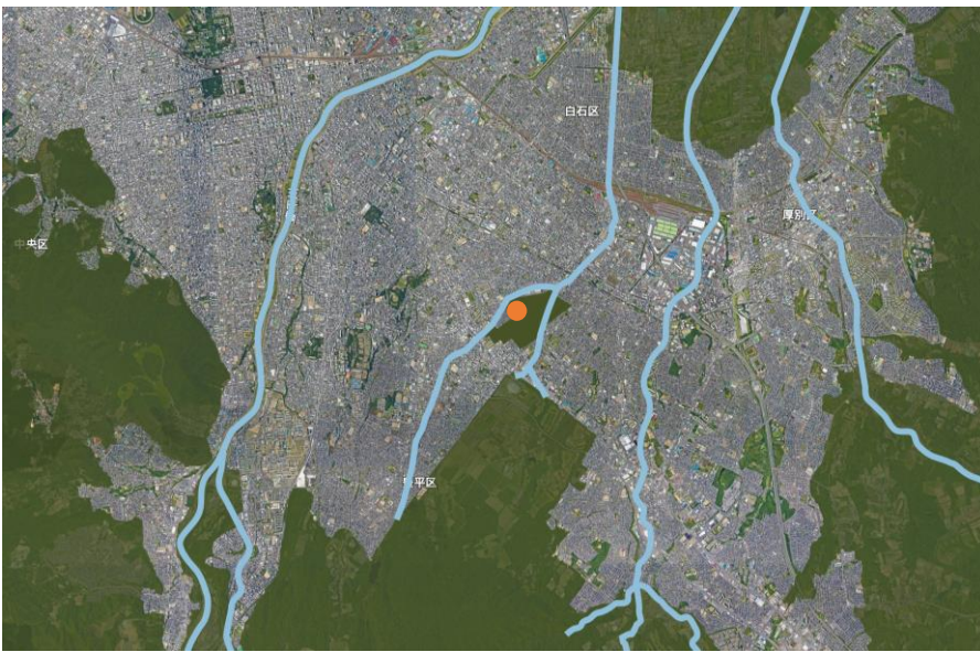
Locating along the river that connects the green area in Sapporo.