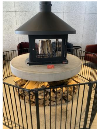
Gangi provides a comfortable under-roof space for moving around even in winter. The common drawing room is installed with a fireplace and becomes a warming room in winter. The firewood placed at Gangi also serves as a space design.