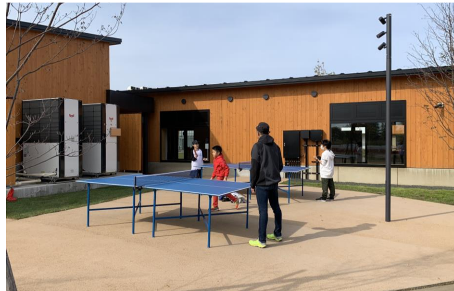
Playing space for families and friends, the equipment is rent-free.