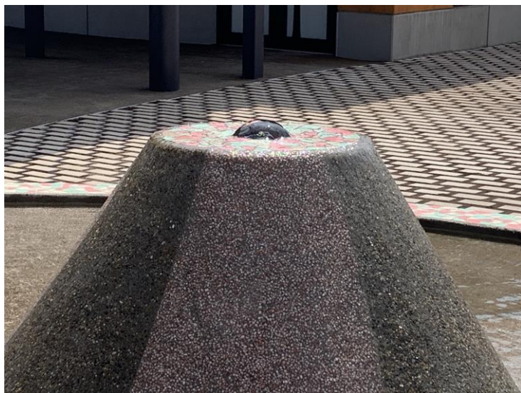
The fountain in the water playground is quietly releasing water from underground.