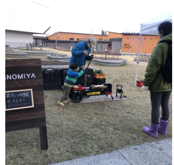
The large lawn plaza surrounded by Gangi is used as a park on a daily basis and for holding events.