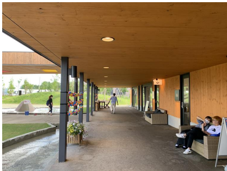
Gangi adjacent to the water playground is wide and provides a rest space for allowing parents to watch their children play