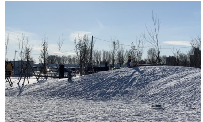
The mound named "Tsukiyama" becomes a place for children to play sledge in winter.