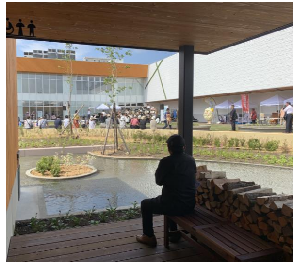
Providing a rest place under the roof