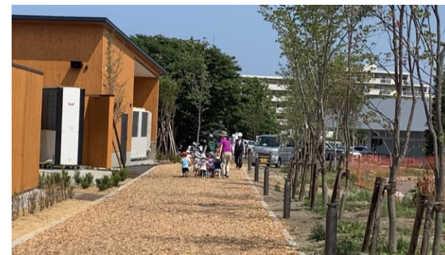
Walking kindergarten children is an everyday scenery.