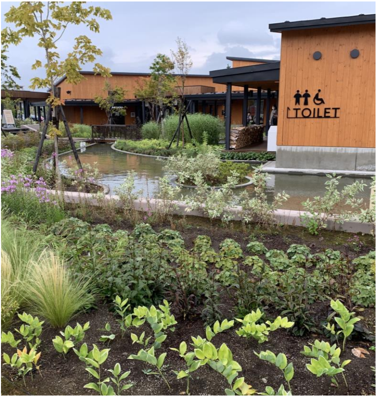
Flowers and plants are managed by local gardeners