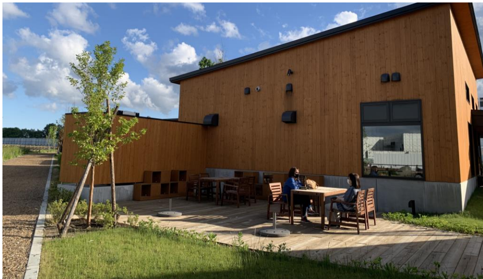
Small space is located along the pedestrian path, away from the main circulation to let visitors spend time alone or in a small group.