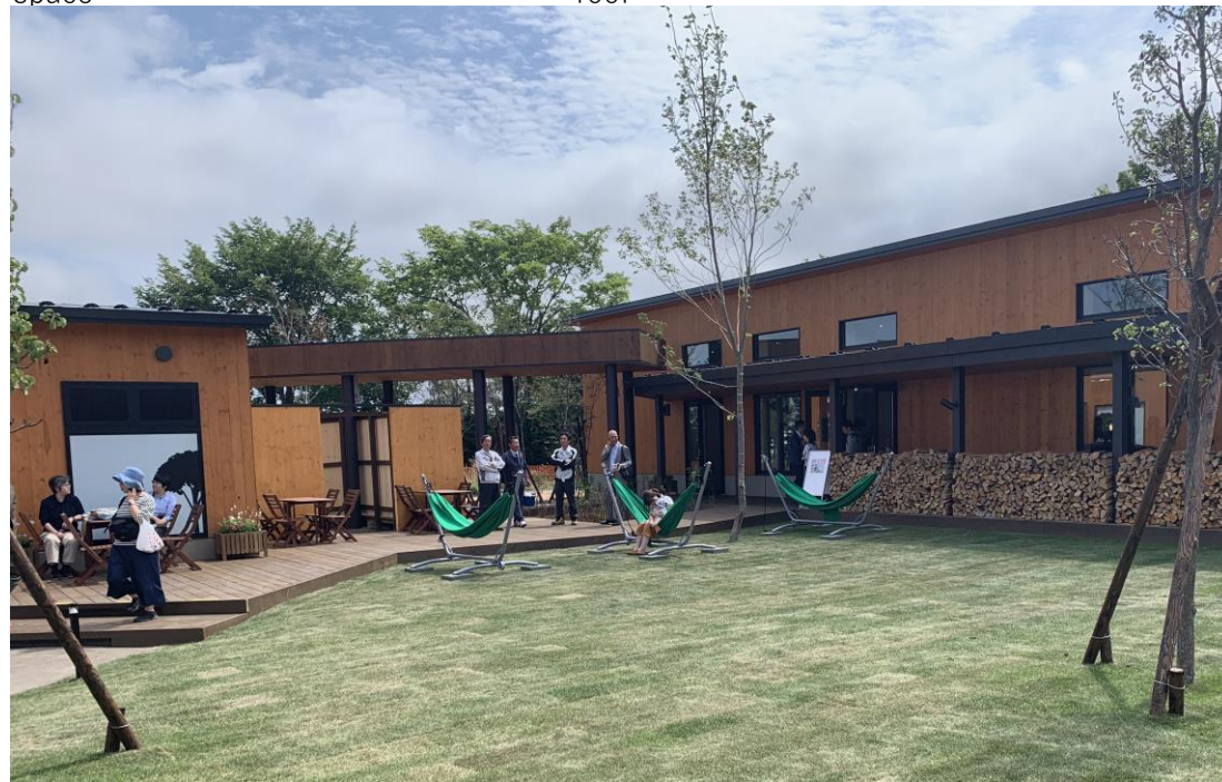
"Hung seat" is set up nearby Gangi, wherever visitors can rest during their walk.