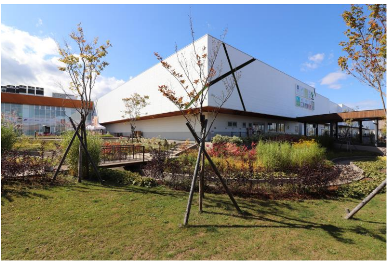
Garden changing follows the season as a place to relax.