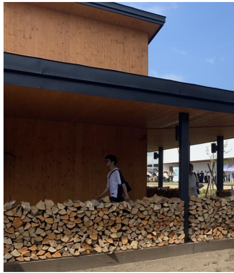
Firewood moderately divides the space