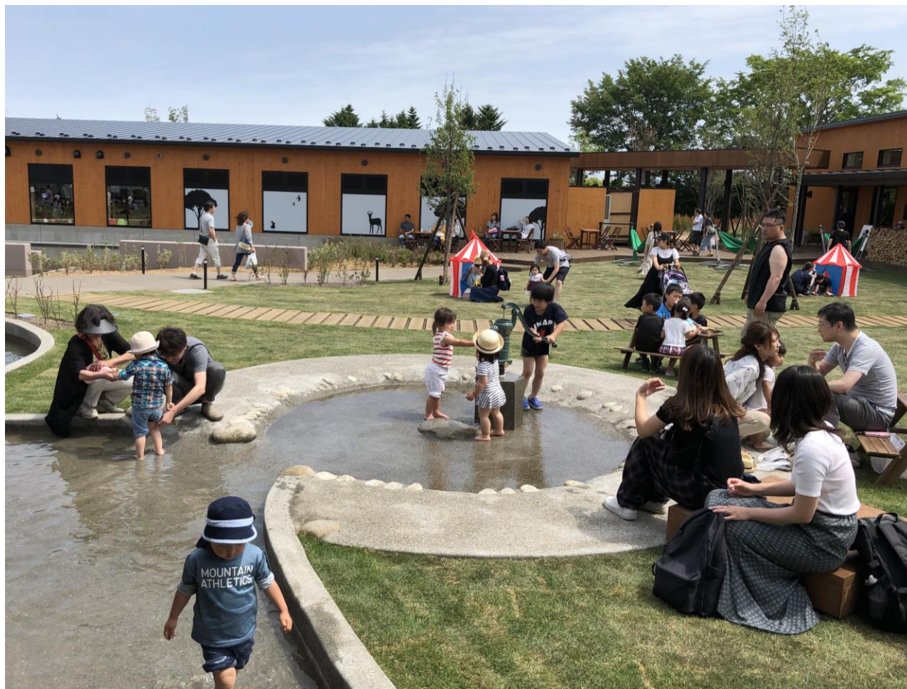
A well pump which was often installed in old houses becomes a popular play spot for children.