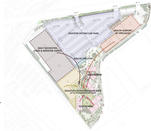
In the event of a disaster, the large space will be used as an evacuation centre to help victims. An agreement has also been signed with Sapporo City to provide food and medical assistance.