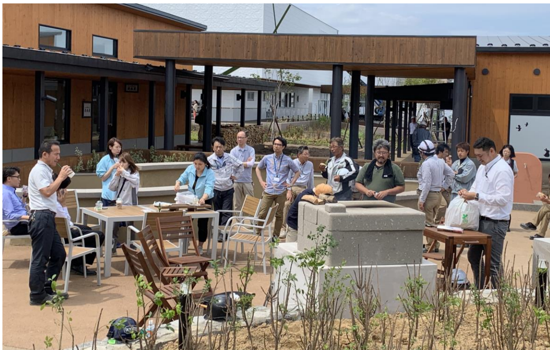
Medium space is reserved for groups, and designed to be as place for interaction.