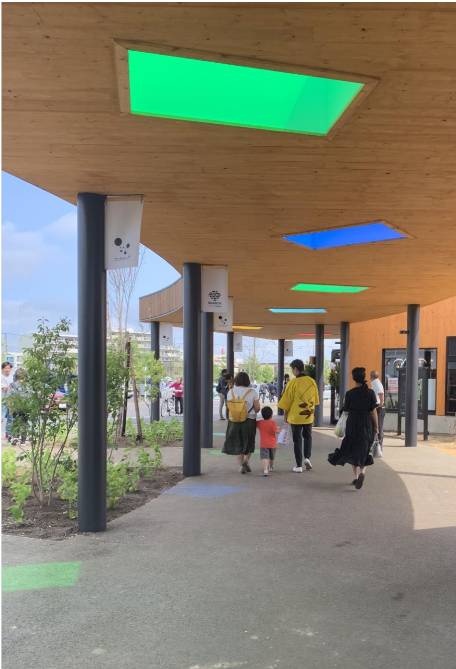
The colourful skylights drop sunlight into the dark space underneath the roof.