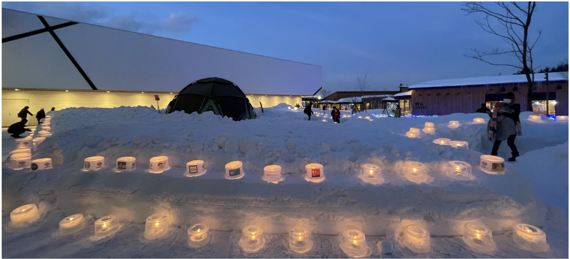
In winter, the ice lighting event is held as a participatory programme.