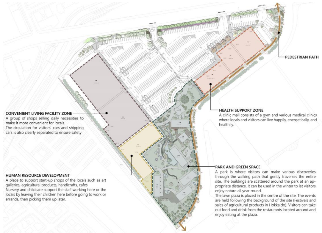
The site is characterised into four zones; Shopping centre, Park, Health support, and Human development.