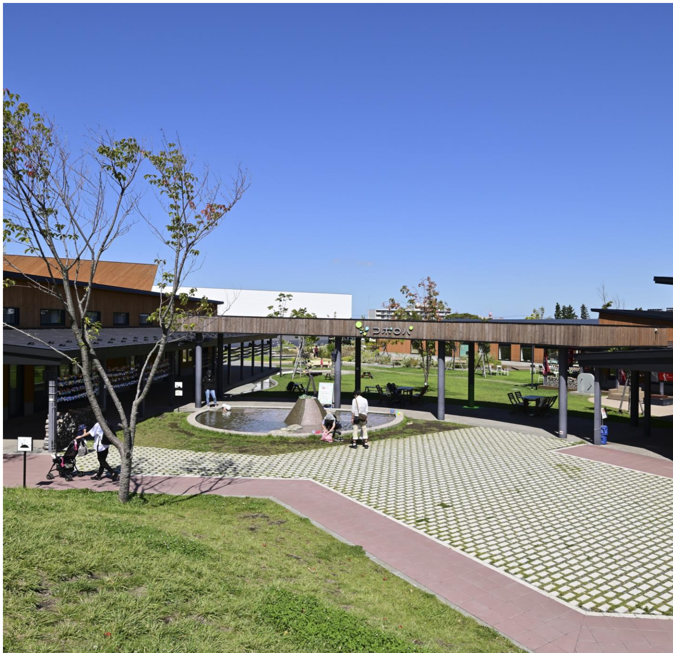
The entrance of the park from the pedestrian path is wide and bright.