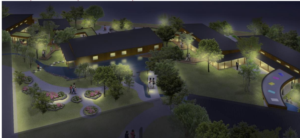
As the lights from the building are bright, the lighting of the landscape emphasises continuity to guild the aisle.