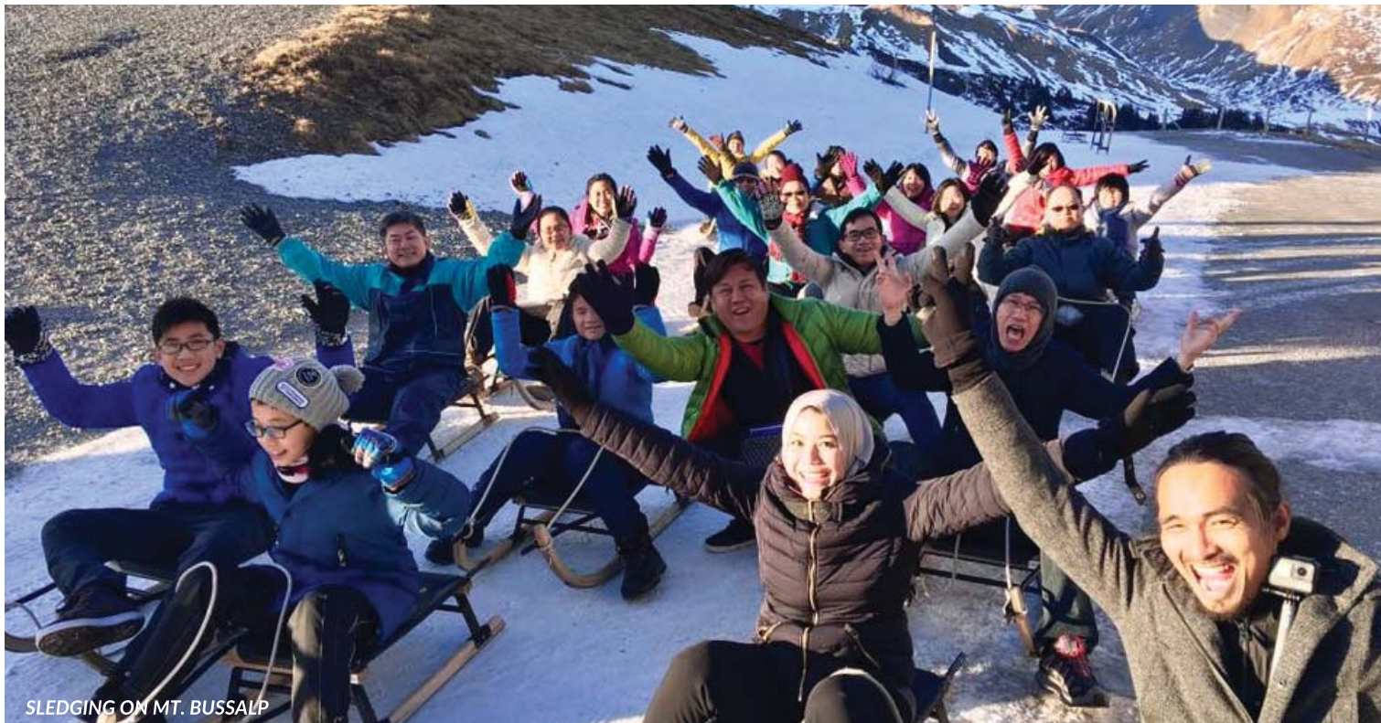
SLEDGING ON MT. BUSSALP