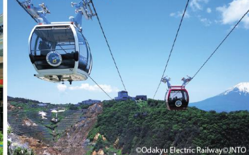
(Day 7) Hakone Ropeway