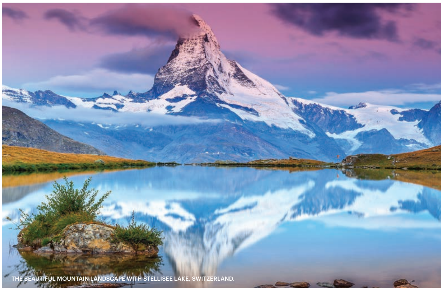
THE BEAUTIFUL MOUNTAIN LANDSCAPE WITH STELLISEE LAKE, SWITZERLAND.

make your way to Rothorn Paradize . Be enchanted by the sweeping views of the Zermatt region from the peaks of Rothorn 3103m. Afterwards, continue your journey to Stellisee Lake , a charming mountain lake that is situated 20 minutes from the cable car station – do note that you will have to walk up a slope to reach your destination. The placid waters of the lake reflect the majestic and jagged Matterhorn. From there you will visit the Matterhorn Museum , a cultural-natural museum, which offers a deeper insight into the history and development of Zermatt.