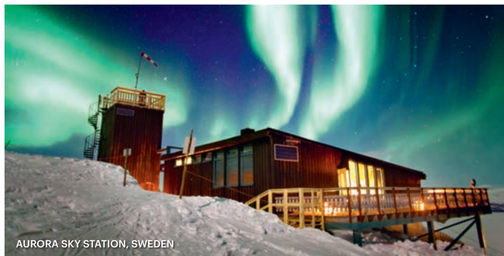
AURORA SKY STATION, SWEDEN