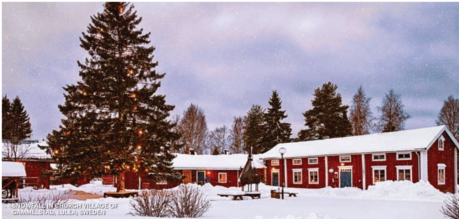
SNOWFALL IN CHURCH VILLAGE OF GAMMELSTAD, LULEÅ, SWEDEN

of light or sound. Upon arrival to Aurora Sky Station , a four-course dinner influenced by the Nordic cuisine is served and will be followed by a guided tour where you will learn about the Aurora Borealis and how to find it.