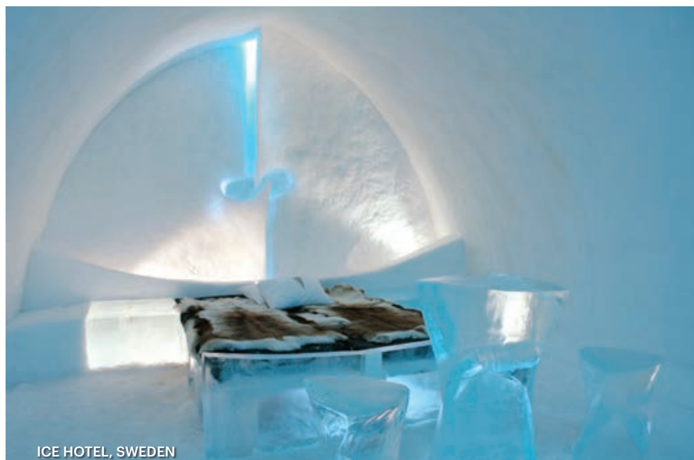
ICE HOTEL, SWEDEN