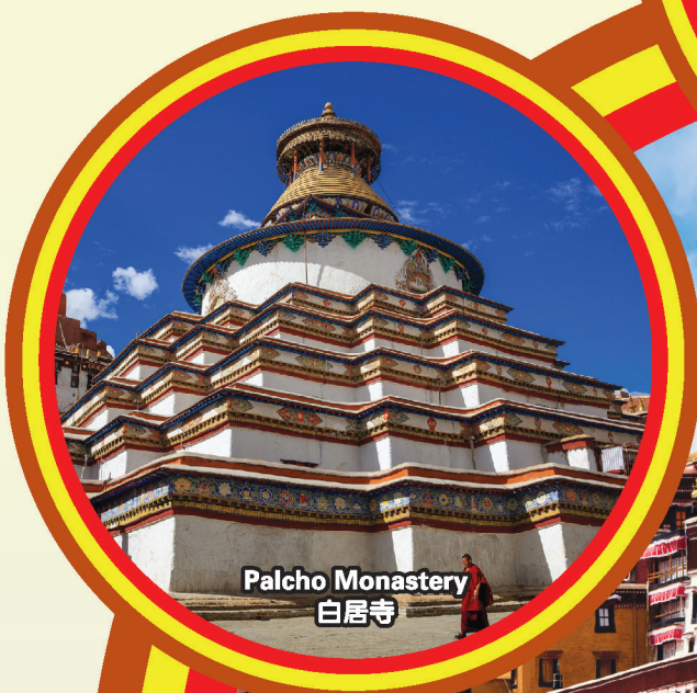
Palcho Monastery 白居寺