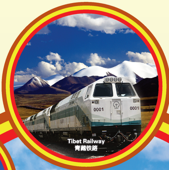
Tibet Railway 青藏铁路