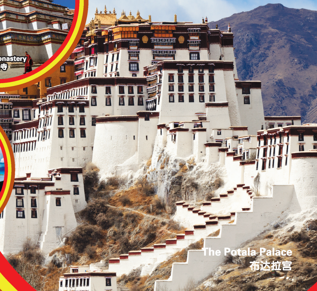
The Potala Palace 布达拉宫

行程次序，以当地旅社安排为准。 Sequences of Itinerary are subject to local arrangement.