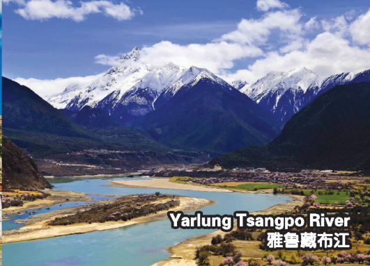
Yarlung Tsangpo River 雅鲁藏布江