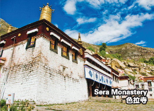
Sera Monastery 色拉寺