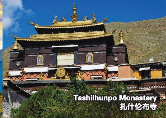
Tashilhunpo Monastery 扎什伦布寺