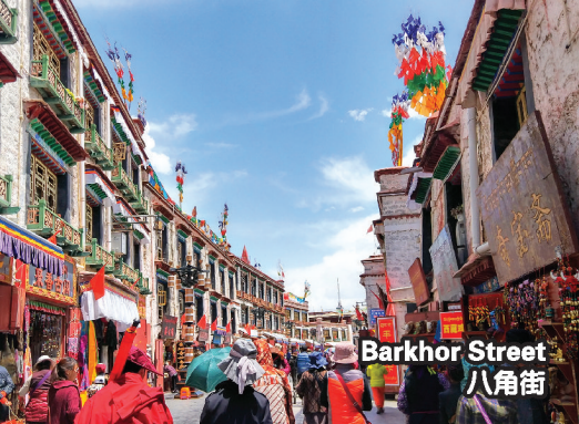
Barkhor Street 八角街