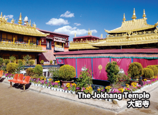
The Jokhang Temple 大昭寺