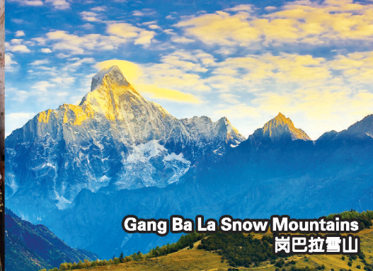
Gang Ba La Snow Mountains 岗巴拉雪山