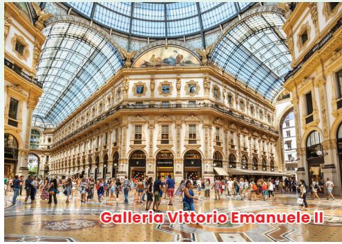
Galleria Vittorio Emanuele II