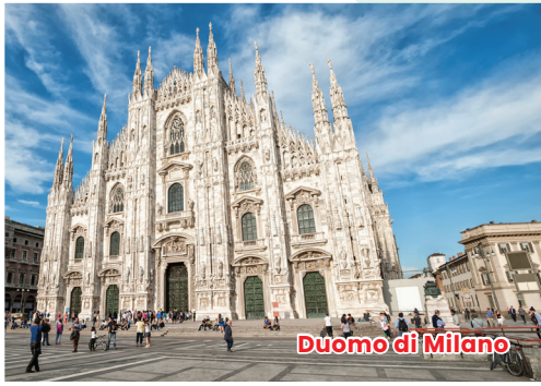
Duomo di Milano