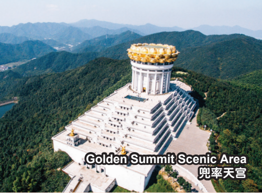
Golden Summit Scenic Area 兜率天宫