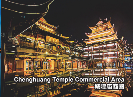
Chenghuang Temple Commercial Area 城隍庙商圈