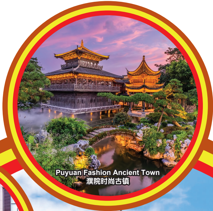
Puyuan Fashion Ancient Town 濮院时尚古镇