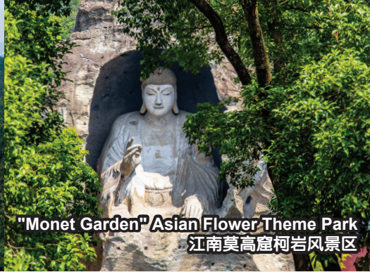
"Monet Garden" Asian Flower Theme Park 江南莫高窟柯岩风景区