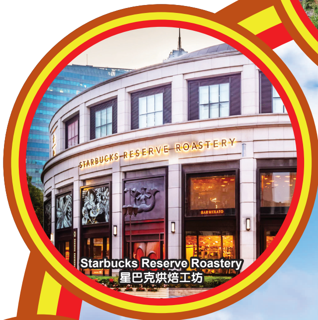
Starbucks Reserve Roastery 星巴克烘焙工坊