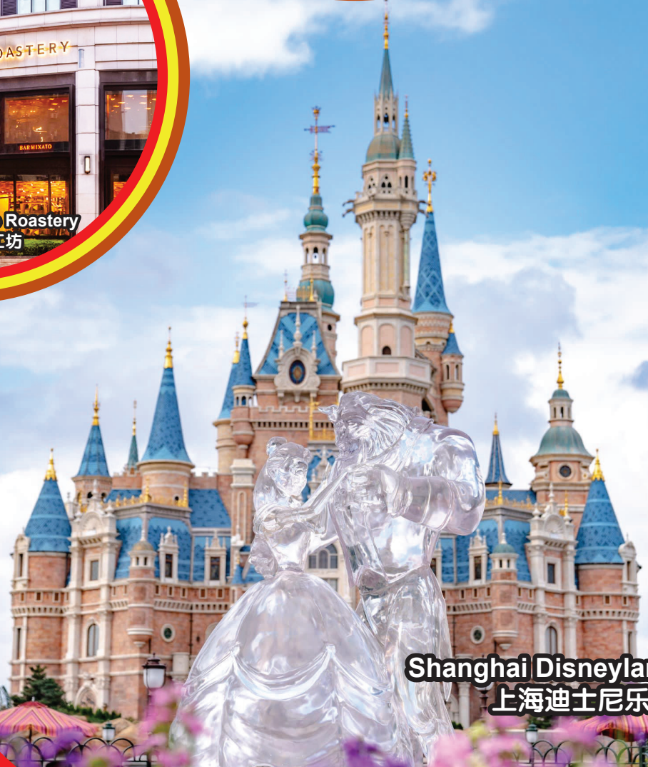
Shanghai Disneyland 上海迪士尼乐园

行程次序，以当地旅社安排为准。 Sequences of Itinerary are subject to local arrangement.