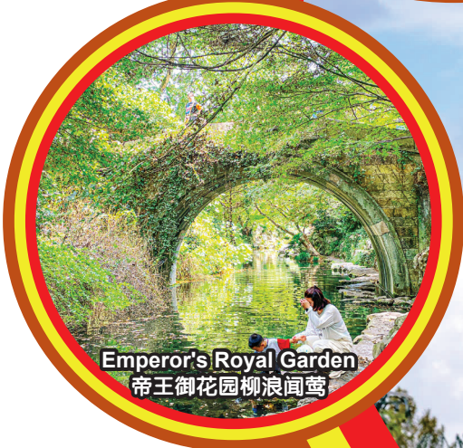
Emperor's Royal Garden 帝王御花园柳浪闻莺