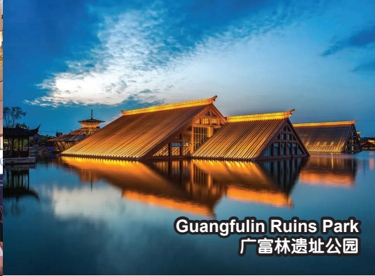
Guangfulin Ruins Park 广富林遗址公园