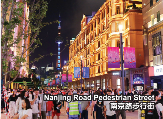
Nanjing Road Pedestrian Street 南京路步行街