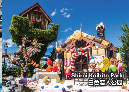
Shirōi Koibito Park 白色恋人公园