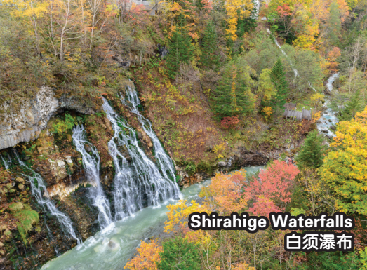
Shirahige Waterfalls 白须瀑布