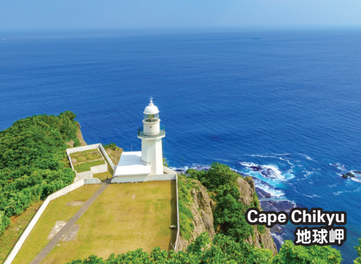
Cape Chikyu 地球岬