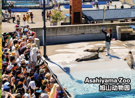
Asahiyama Zoo 旭山动物园