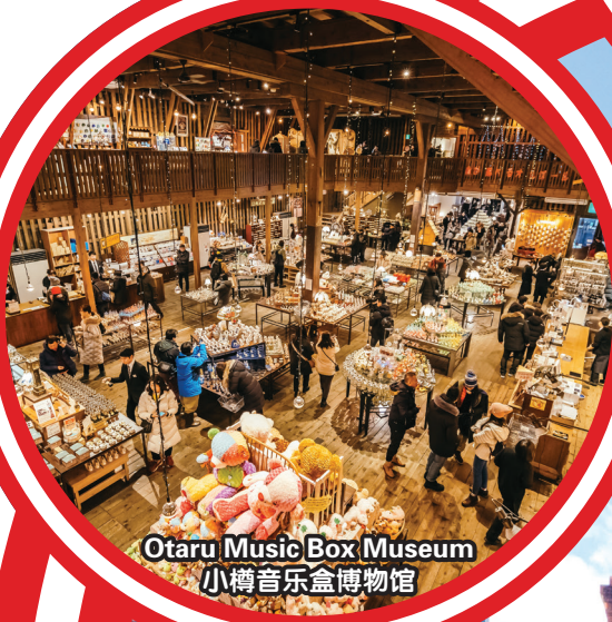
Otaru Music Box Museum 小樽音乐盒博物馆