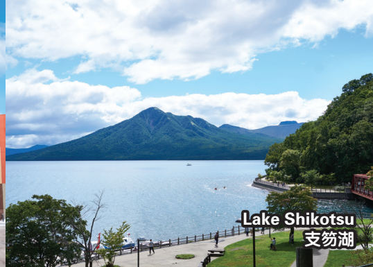
Lake Shikotsu 支笏湖