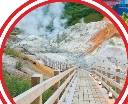
Noboribetsu Jigokudani 登别地狱谷

行程次序，以当地旅社安排为准。 Sequences of Itinerary are subject to local arrangement.