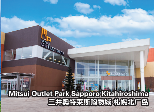
Mitsui Outlet Park Sapporo Kitahiroshima 三井奥特莱斯购物城 札幌北广岛