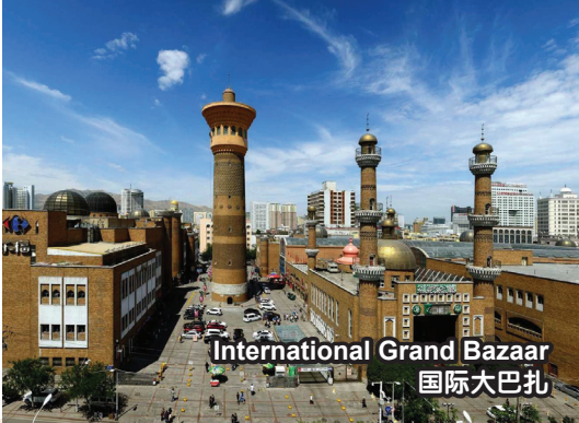
International Grand Bazaar 国际大巴扎