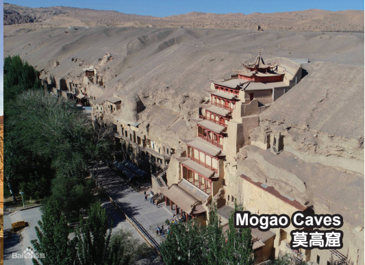
Mogao Caves 莫高窟