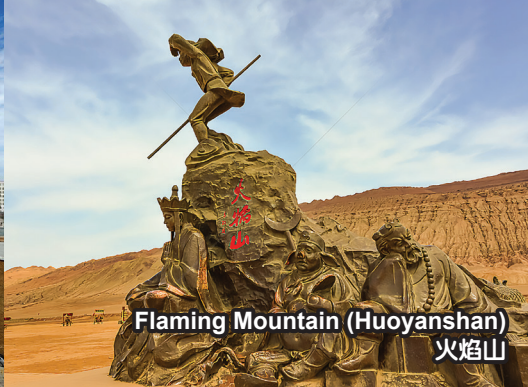
Flaming Mountain (Huoyanshan) 火焰山