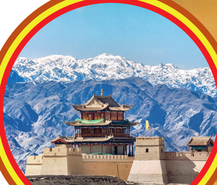
Jiayuguan Pass 嘉峪关城楼