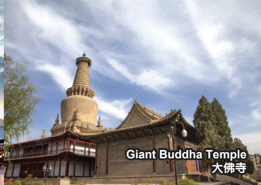
Giant Buddha Temple 大佛寺