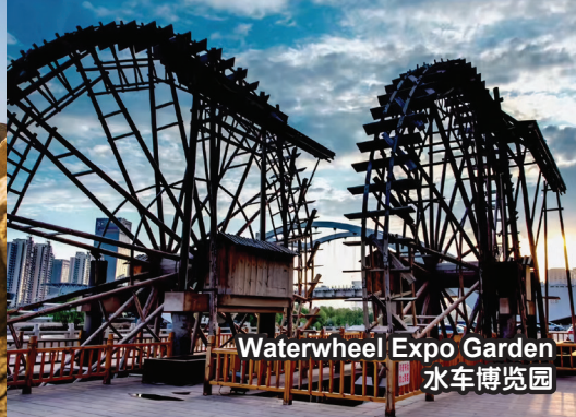
Waterwheel Expo Garden 水车博览园