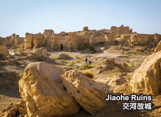
Jiaohe Ruins 交河故城