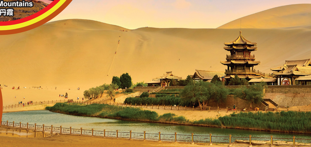
Mingsha Mountain and Crescent Moon Spring 鸣沙山月牙泉

行程次序，以当地旅社安排为准。 Sequences of Itinerary are subject to local arrangement.