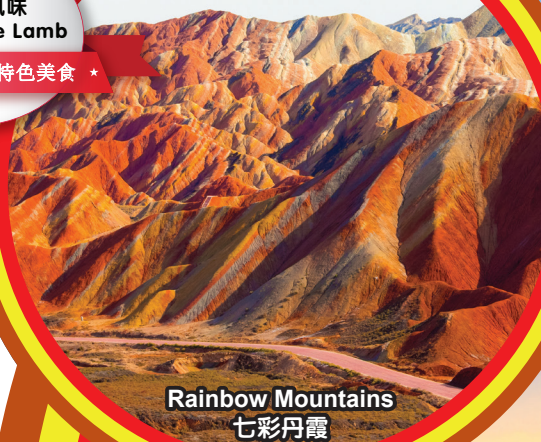
Rainbow Mountains 七彩丹霞