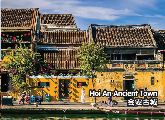
Hoi An Ancient Town 会安古城