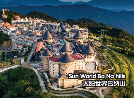
Sun World Ba Na Hills 太阳世界巴纳山