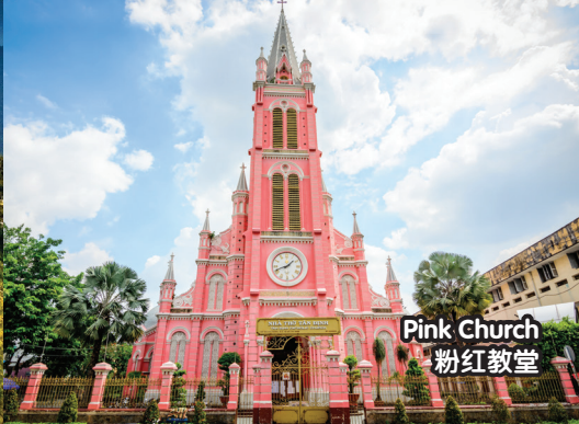
Pink Church 粉红教堂