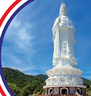
Son Tra Peninsula 山茶半岛

行程次序，以当地旅社安排为准。 Sequences of Itinerary are subject to local arrangement.