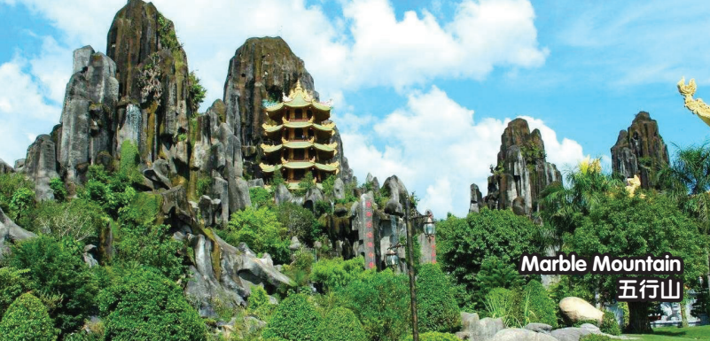
Marble Mountain 五行山