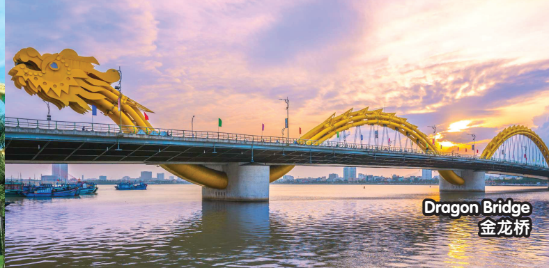
Dragon Bridge 金龙桥