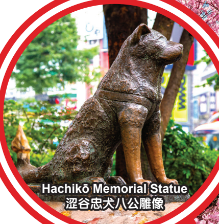
Hachikō Memorial Statue 涩谷忠犬八公雕像