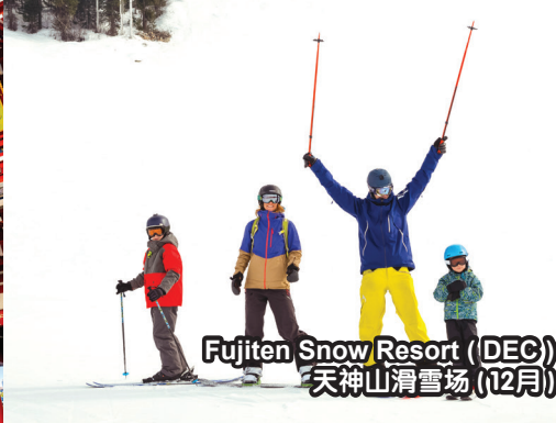
Fujiten Snow Resort (DEC) 天神山滑雪场 (12月)