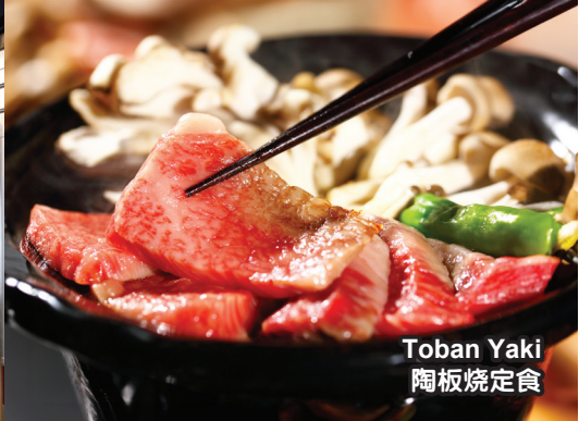
Toban Yaki 陶板烧定食