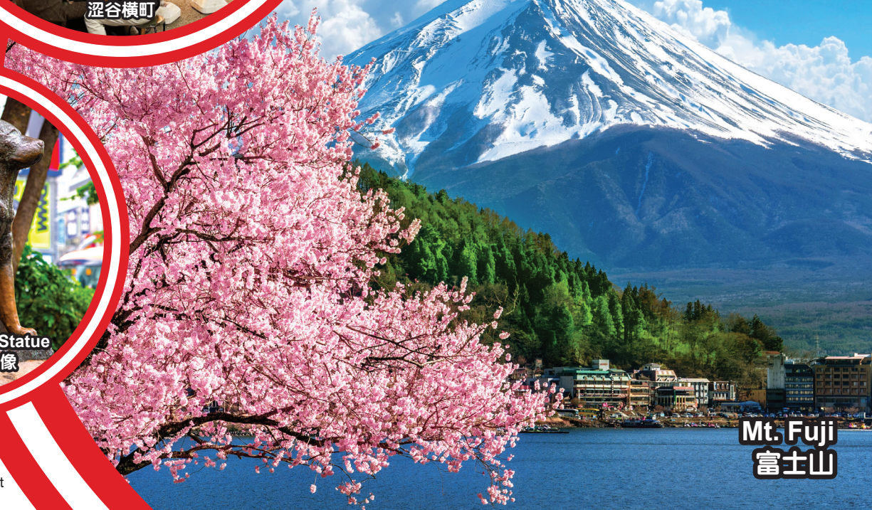
Mt. Fuji 富士山

行程次序，以当地旅社安排为准。 Sequences of Itinerary are subject to local arrangement.