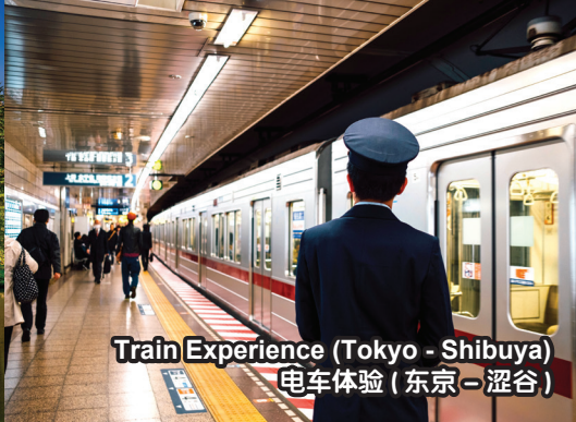
Train Experience (Tokyo - Shibuya) 电车体验 (东京-涩谷)