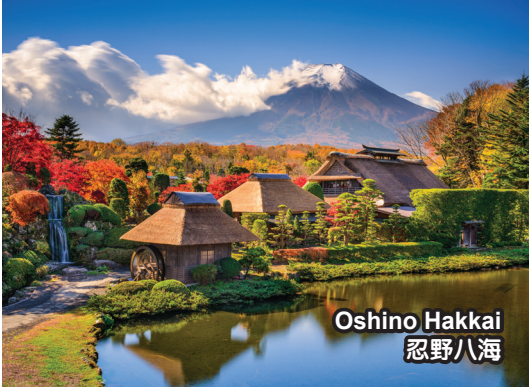
Oshino Hakkai 忍野八海