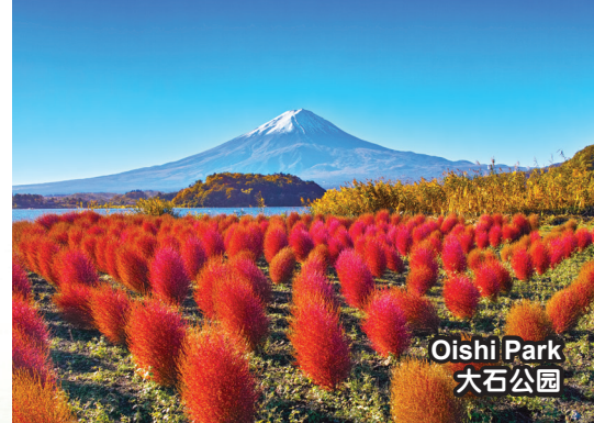
Oishi Park 大石公園