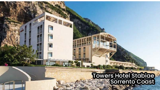
Towers Hotel Stabiae Sorrento Coast

Embark on a complete journey at 4-star & 5-star hotel, offering a quality & comfortable stay. 全程安排四+五星酒店，让您在整个旅程中享受到有质量且舒适的住宿环境。