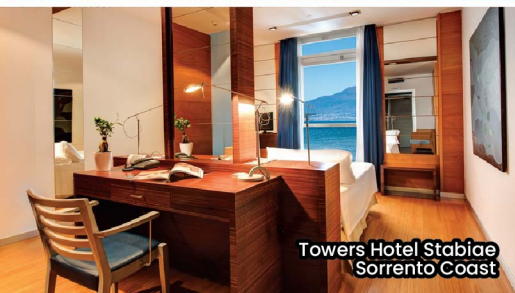
Towers Hotel Stabiae Sorrento Coast