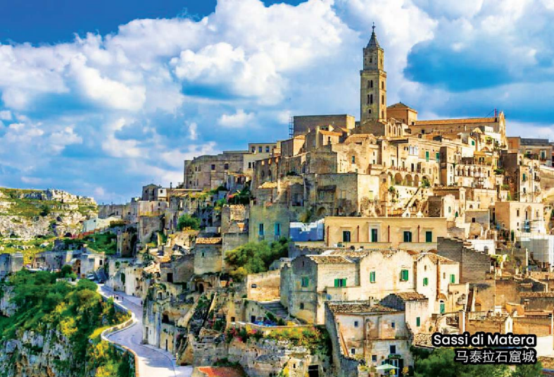
Sassi di Matera 马泰拉石窟城