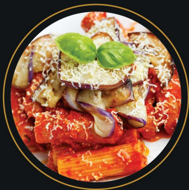
Pasta alla Norma