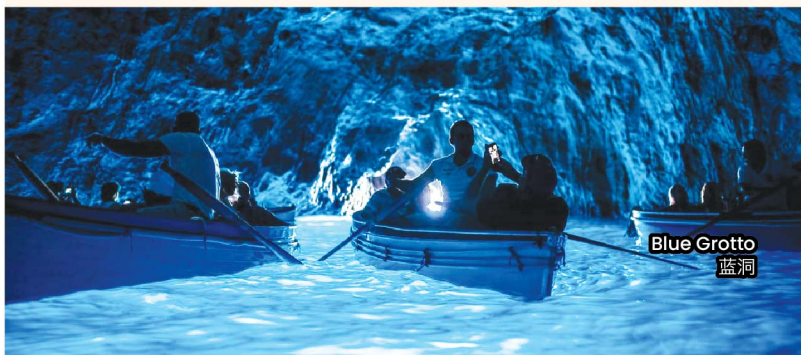
Blue Grotto 蓝洞

行程次序以当地旅行社安排为准。行程，膳食，住宿，交通等可能会因不可抗拒因素而更动，恕不另行通知。