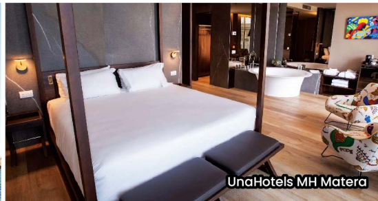
UnaHotels MH Matera