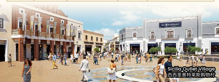
Sicilia Outlet Village 西西里奥特莱斯购物村