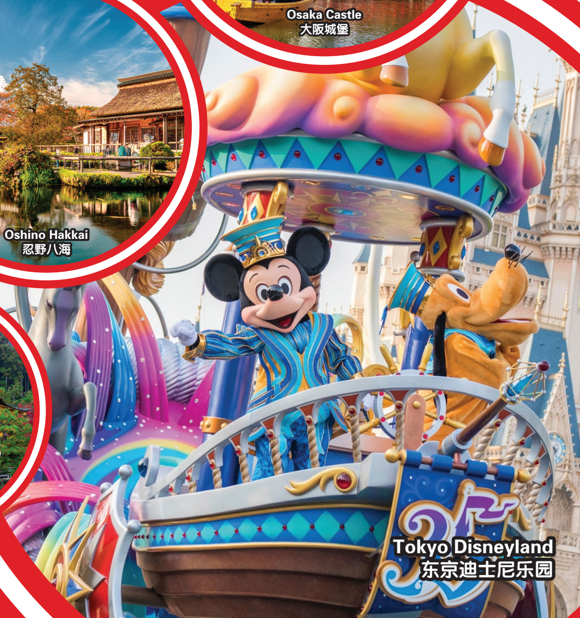
Tokyo Disneyland 东京迪士尼乐园

行程次序，以当地旅社安排为准。 Sequences of Itinerary are subject to local arrangement.