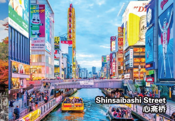
Shinsaibashi Street 心斎橋