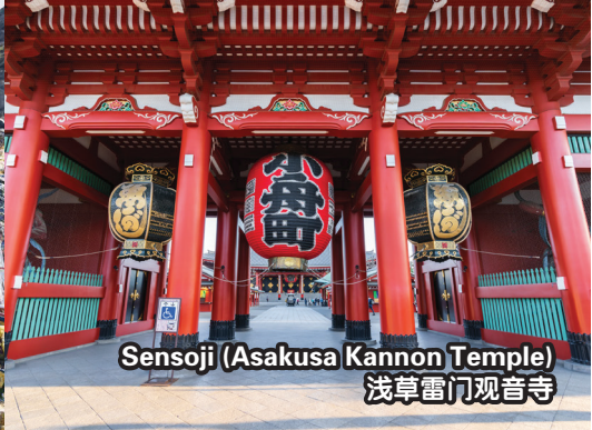
Sensoji (Asakusa Kannon Temple) 浅草雷门观音寺