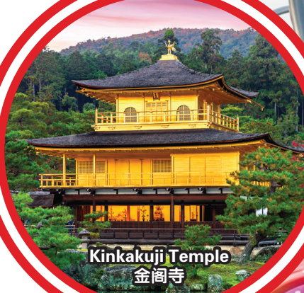
Kinkakuji Temple 金阁寺