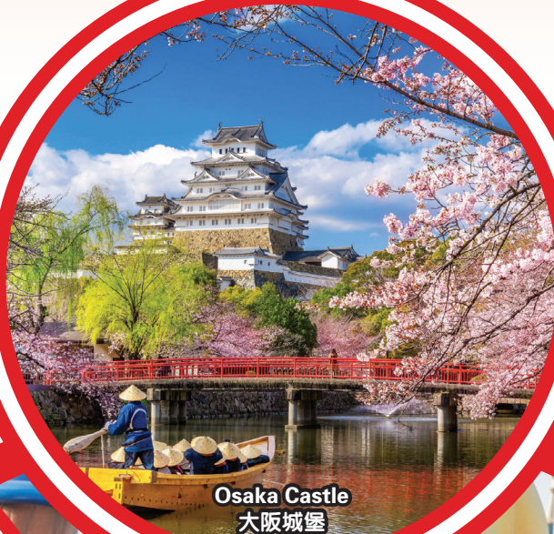
Osaka Castle 大阪城堡