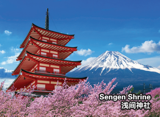
Sengen Shrine 浅間神社