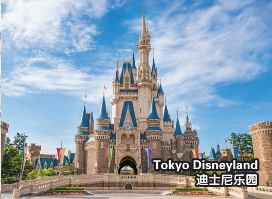
Tokyo Disneyland 迪士尼乐园