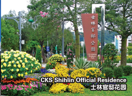
CKS Shihlin Official Residence 士林官邸花园