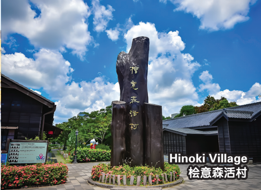
Hinoki Village 松意森活村