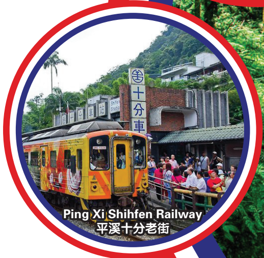
Ping Xi Shihfen Railway 平溪十分老街

行程次序，以当地旅社安排为准。 Sequences of Itinerary are subject to local arrangement.