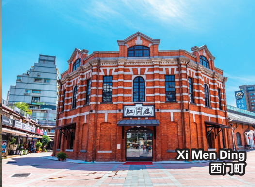
Xi Men Ding 西门町