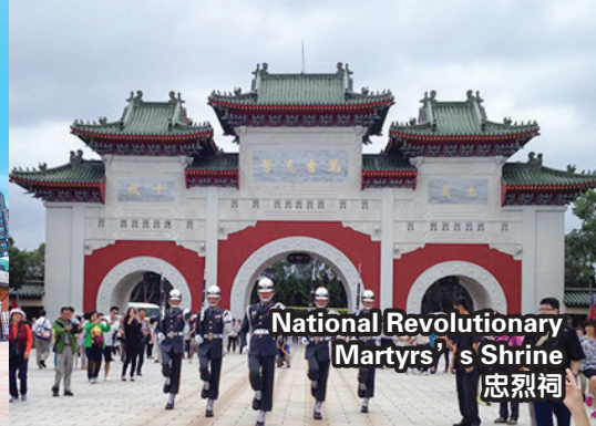
National Revolutionary Martyrs' Shrine 忠烈祠