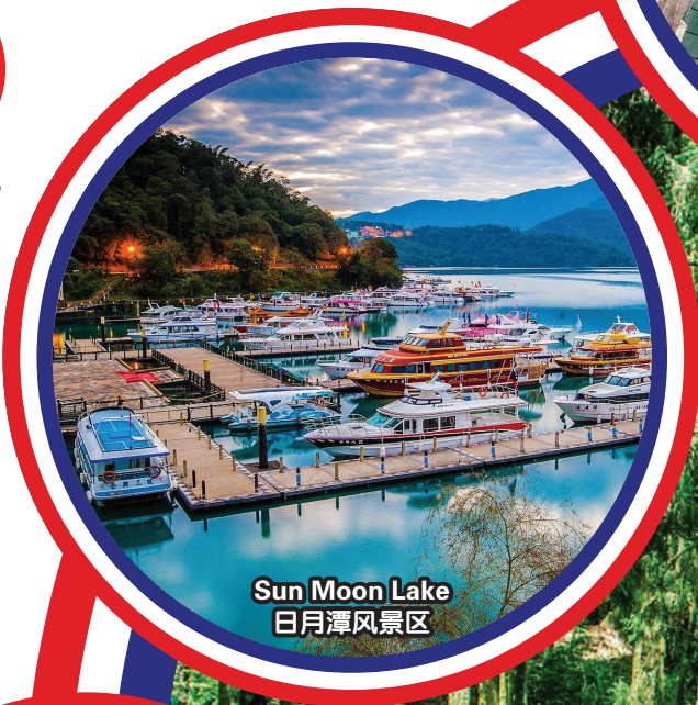
Sun Moon Lake 日月潭风景区