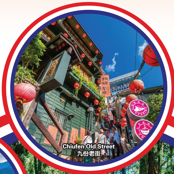
Chiufen Old Street 九份老街