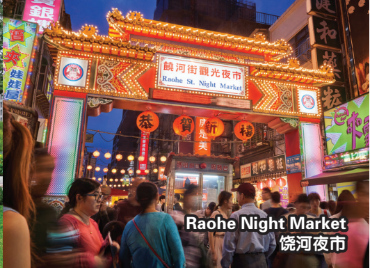
Raohe Night Market 饶河夜市