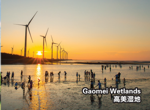
Gaomei Wetlands 高美湿地