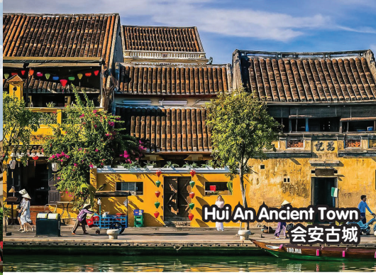
Hui An Ancient Town 会安古城