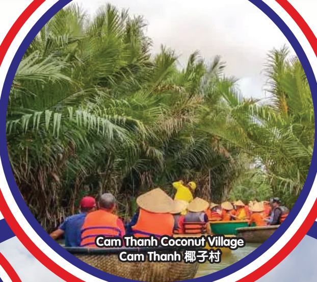
Cam Thanh Coconut Village Cam Thanh 椰子村