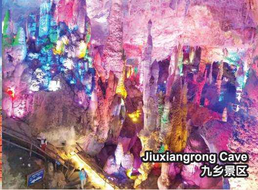
Jiuxiangrong Cave 九乡景区