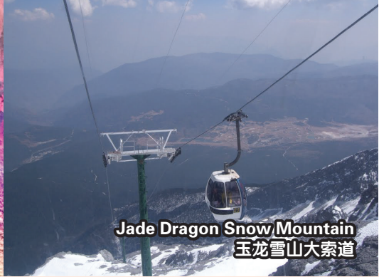
Jade Dragon Snow Mountain 玉龙雪山大索道