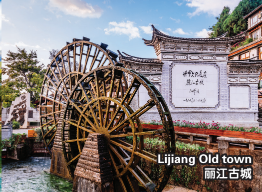
Lijiang Old town 丽江古城