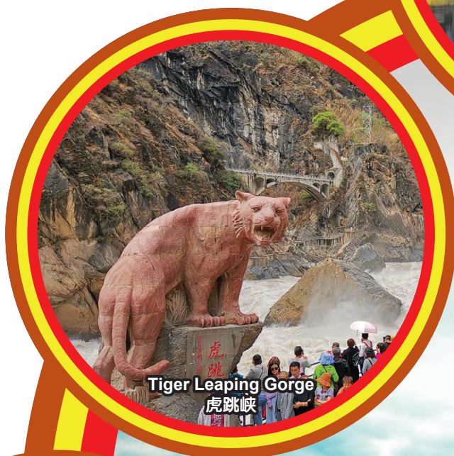
Tiger Leaping Gorge 虎跳峡