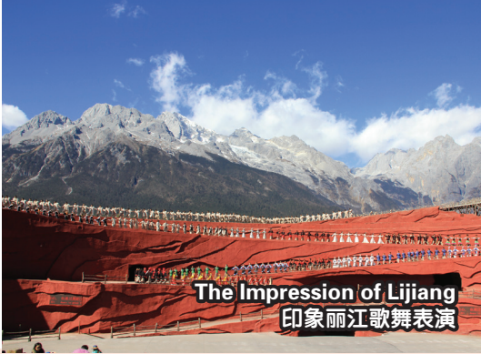
The Impression of Lijiang 印象丽江歌舞表演