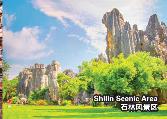
Shilin Scenic Area 石林风景区