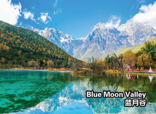
Blue Moon Valley 蓝月谷