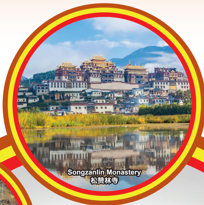
Songzanlin Monastery 松赞林寺