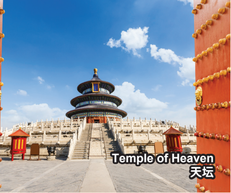
Temple of Heaven 天坛