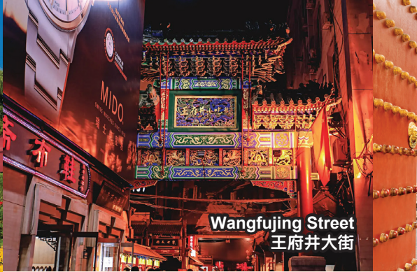
Wangfujing Street 王府井大街