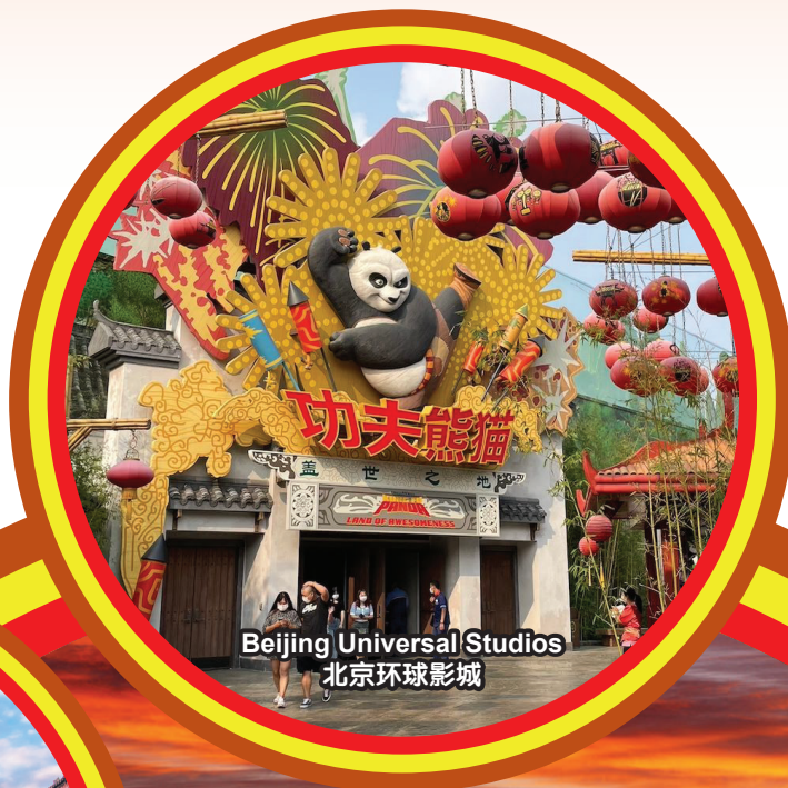
Beijing Universal Studios 北京环球影城

5星级酒店：北京潮白河喜来登酒店或同级 5 STAR HOTEL: BEIJING CHAOBAIHE SHERATON HOTEL OR EQUIVALENT