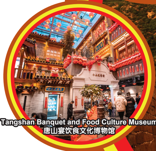
Tangshan Banquet and Food Culture Museum 唐山宴饮食文化博物馆

行程次序，以当地旅社安排为准。 Sequences of Itinerary are subject to local arrangement.