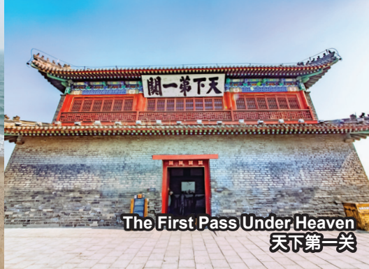
The First Pass Under Heaven 天下第一关