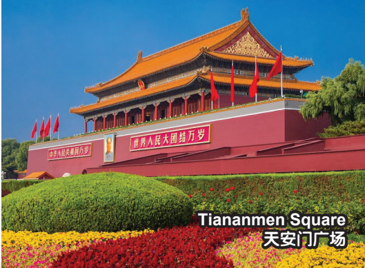
Tiananmen Square 天安门广场