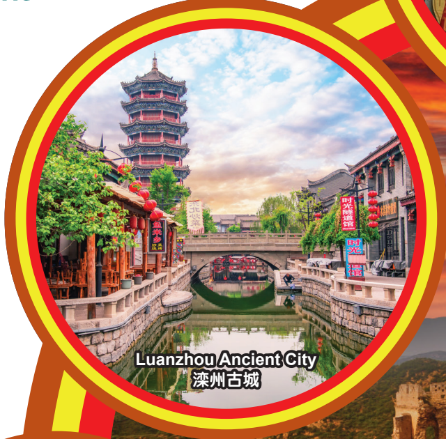
Luanzhou Ancient City 滦州古城