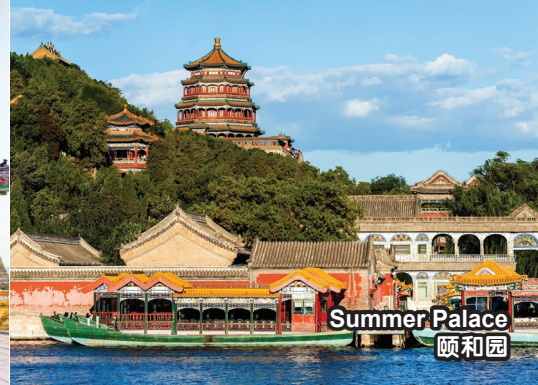
Summer Palace 颐和园