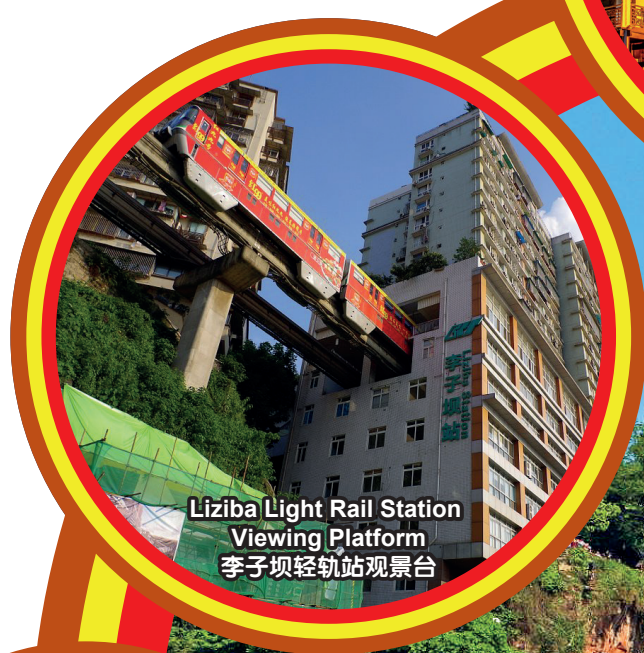
Liziba Light Rail Station Viewing Platform 李子坝轻轨站观景台