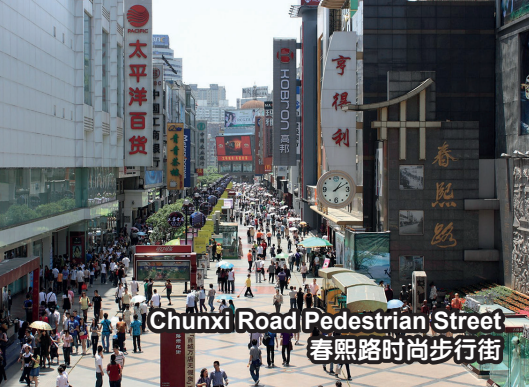
Chunxi Road Pedestrian Street 春熙路时尚步行街