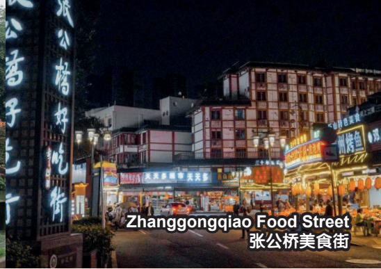
Zhanggongqiao Food Street 张公桥美食街