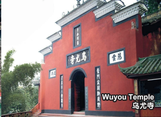
Wuyou Temple 乌尤寺