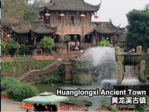
Huanglongxi Ancient Town 黄龙溪古镇