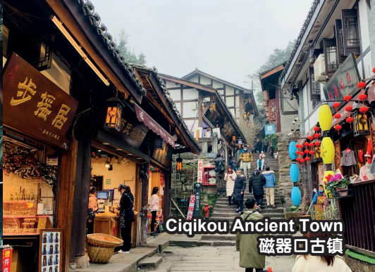
Ciqikou Ancient Town 磁器口古镇