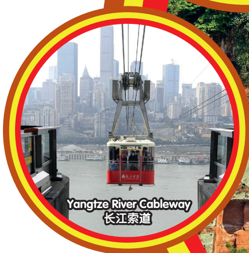
Yangtze River Cableway 长江索道

行程次序，以当地旅社安排为准。 Sequences of Itinerary are subject to local arrangement.