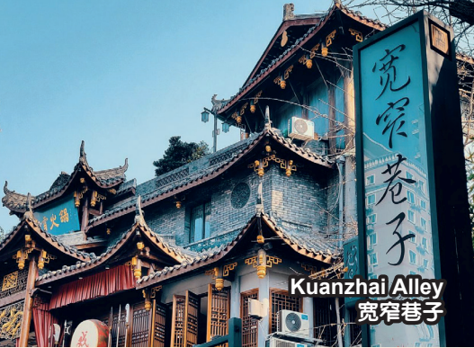
Kuanzhai Alley 宽窄巷子