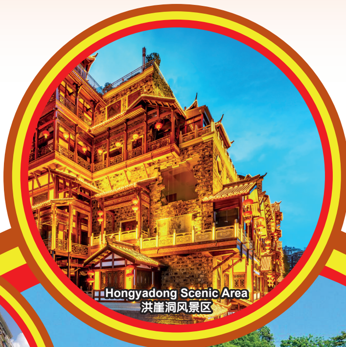
Hongyadong Scenic Area 洪崖洞风景区