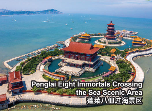
Penglai Eight Immortals Crossing the Sea Scenic Area 蓬萊八仙過海景區