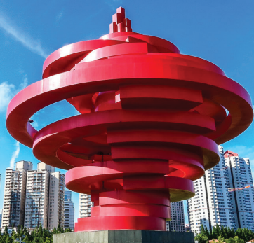
May Fourth Square 五四广场