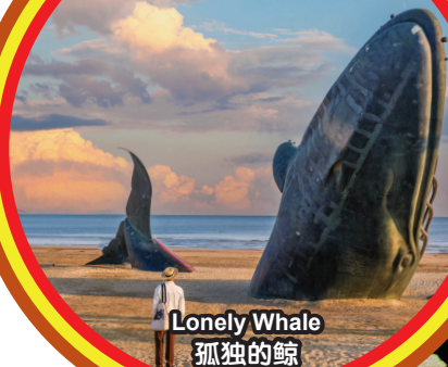
Lonely Whale 孤独的鲸