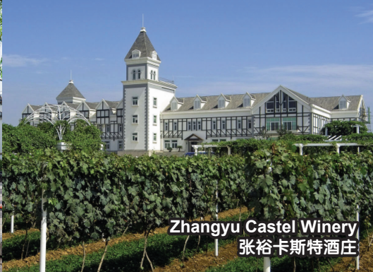
Zhangyu Castel Winery 张裕卡斯特酒庄