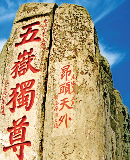
Mount Tai 泰山

行程次序, 以当地旅社安排为准。 Sequences of Itinerary are subject to local arrangement.