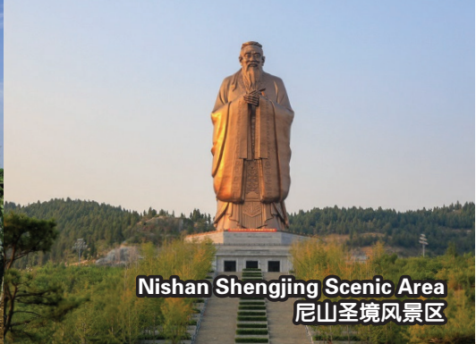
Nishan Shengjing Scenic Area 尼山圣境风景区