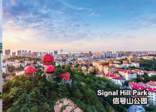
Signal Hill Park 信号山公园