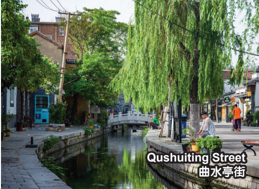
Qushuiting Street 曲水亭街