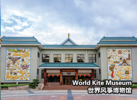
World Kite Museum 世界风筝博物馆