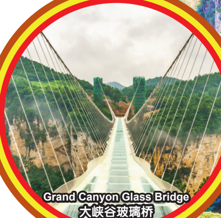
Grand Canyon Glass Bridge 大峡谷玻璃桥

行程次序，以当地旅社安排为准。 Sequences of Itinerary are subject to local arrangement.