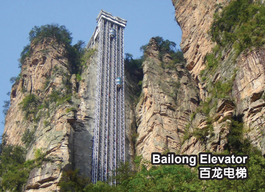
Bailong Elevator 百龙电梯