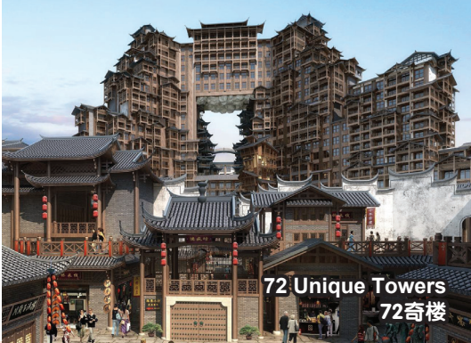
72 Unique Towers 72奇楼