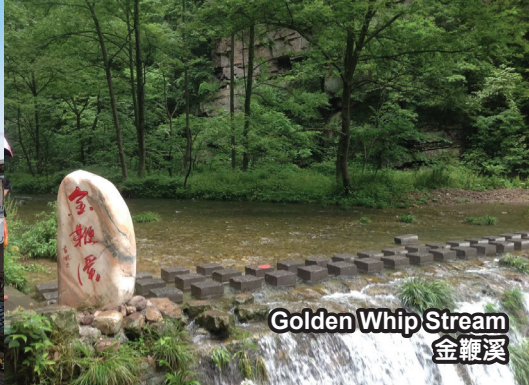
Golden Whip Stream 金鞭溪