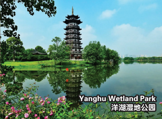
Yanghu Wetland Park 洋湖湿地公园