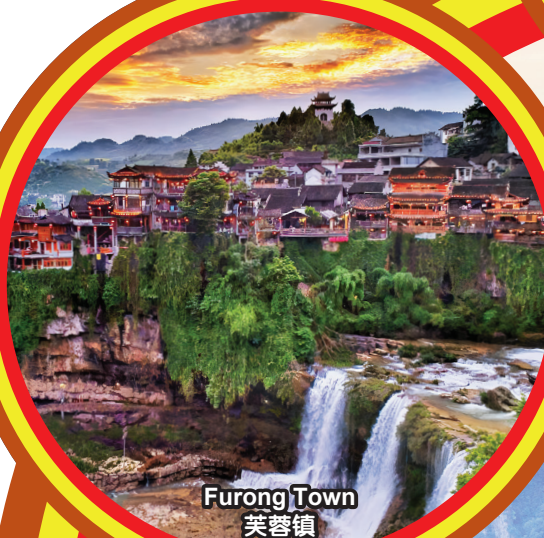
Furong Town 芙蓉镇