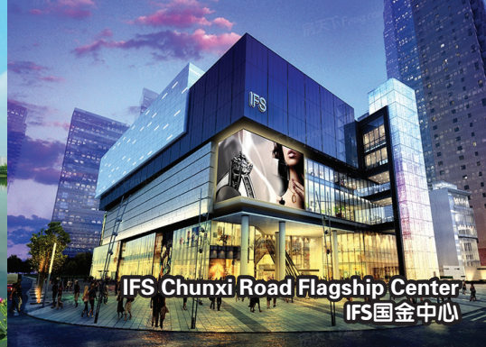
IFS Chunxi Road Flagship Center IFS国金中心