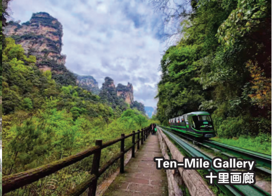
Ten-Mile Gallery 十里画廊