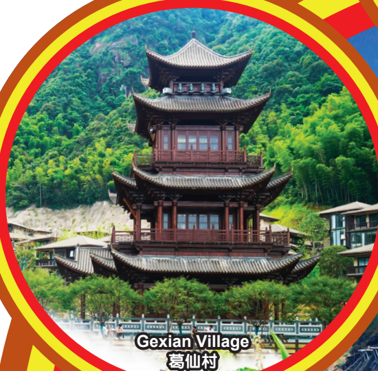
Gexian Village 葛仙村