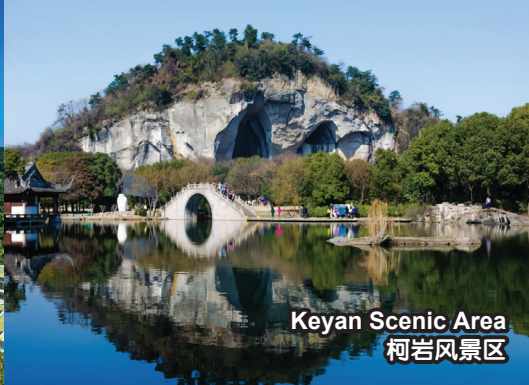
Keyan Scenic Area 柯岩风景区