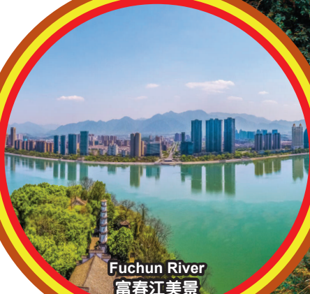
Fuchun River 富春江美景