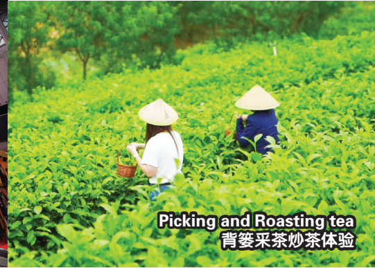
Picking and Roasting tea 背篓采茶炒茶体验