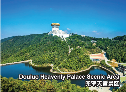
Douluo Heavenly Palace Scenic Area 兜率天宫景区