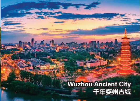
Wuzhou Ancient City 千年婺州古城