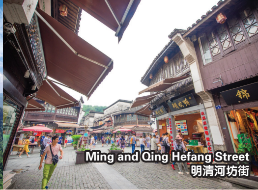
Ming and Qing Hefang Street 明清街坊街