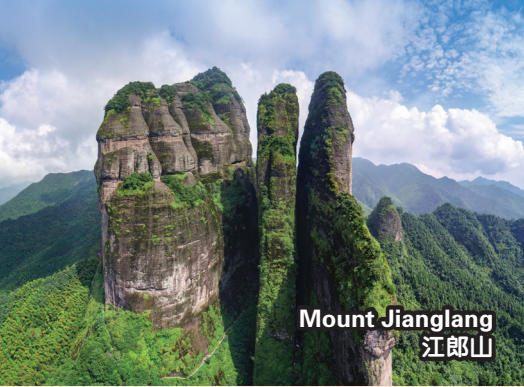
Mount Jianglang 江郎山