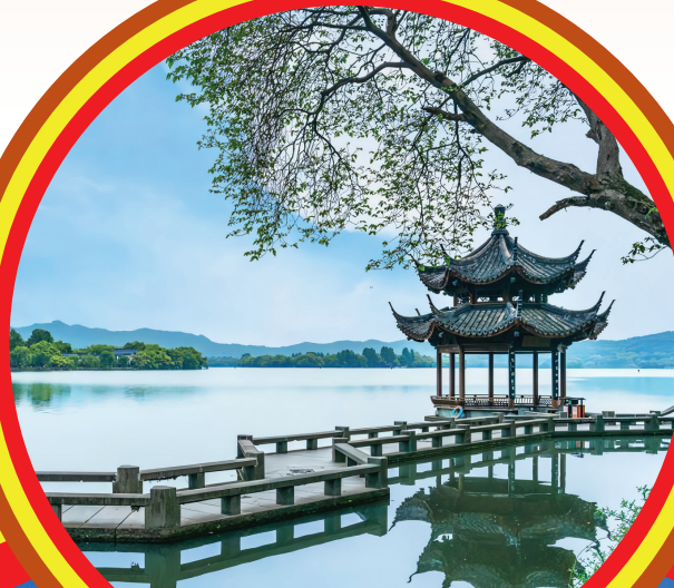
West Lake Scenic Area 西湖风景名胜区