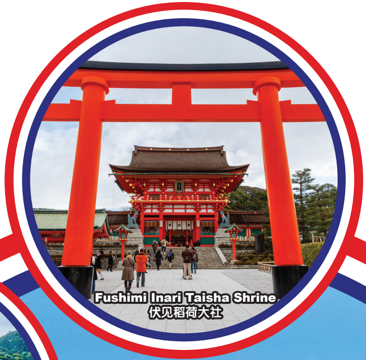
Fushimi Inari Taisha Shrine 伏见稻荷大社