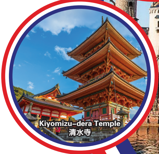
Kiyomizu-dera Temple 清水寺