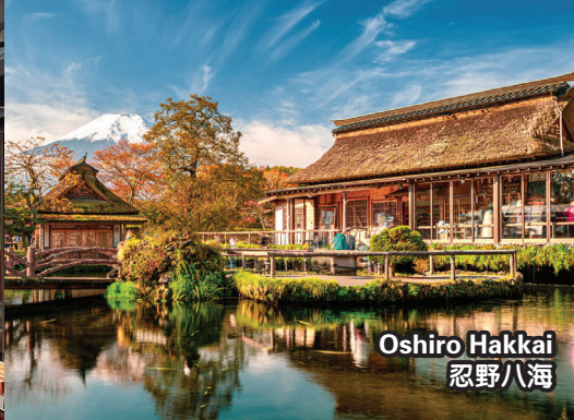
Oshiro Hakkai 忍野八海