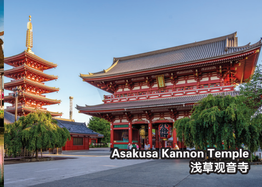
Asakusa Kannon Temple 浅草観音寺