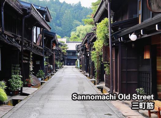
Sannomachi Old Street 三町筋