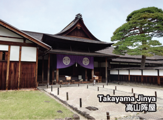
Takayama Jinya 高山陣屋