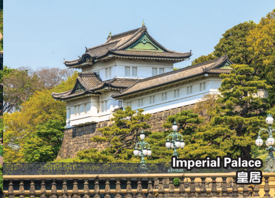
Imperial Palace 皇居