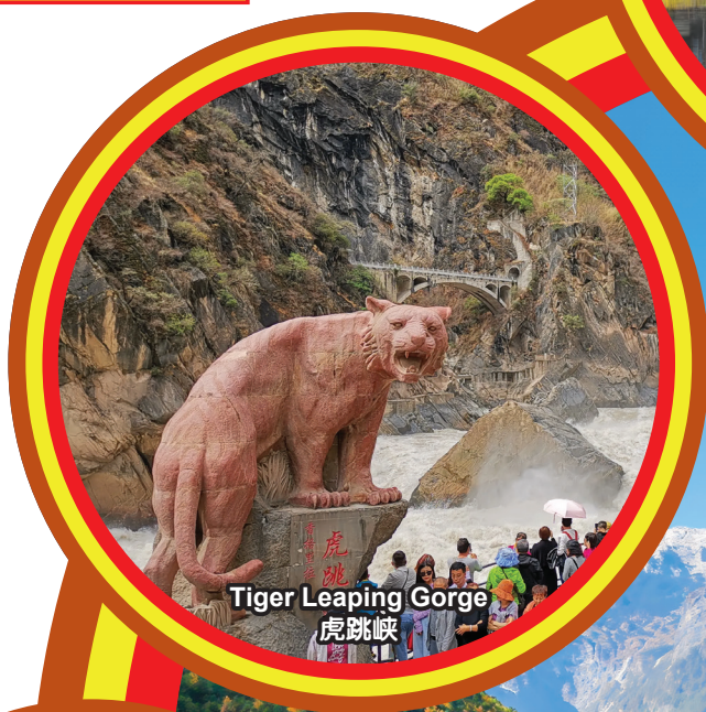
Tiger Leaping Gorge 虎跳峡