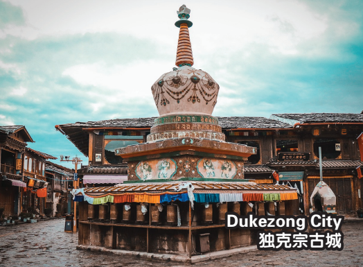
Dukezong City 独克宗古城