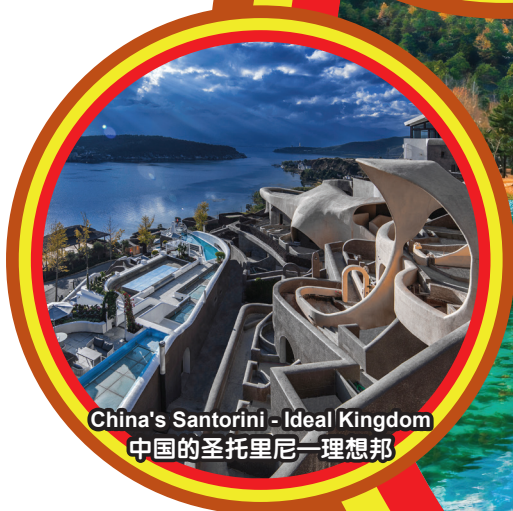
China's Santorini - Ideal Kingdom 中国的圣托里尼—理想邦

行程次序，以当地旅社安排为准。 Sequences of Itinerary are subject to local arrangement.