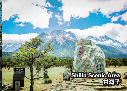
Shilin Scenic Area 海子