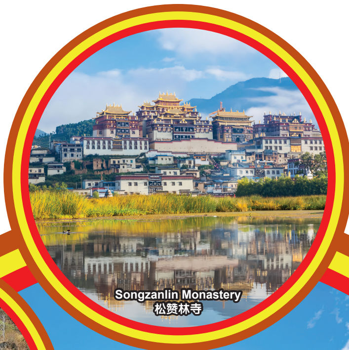
Songzanlin Monastery 松赞林寺