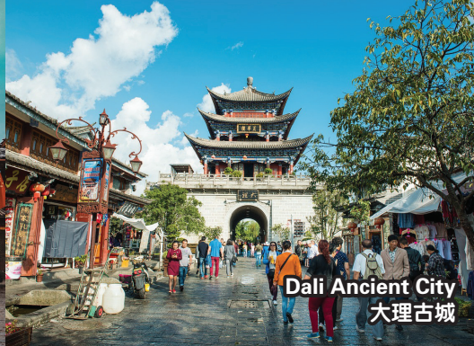
Dali Ancient City 大理古城