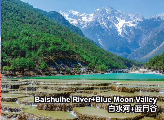
Baishuihe River+Blue Moon Valley 白水河+蓝月谷