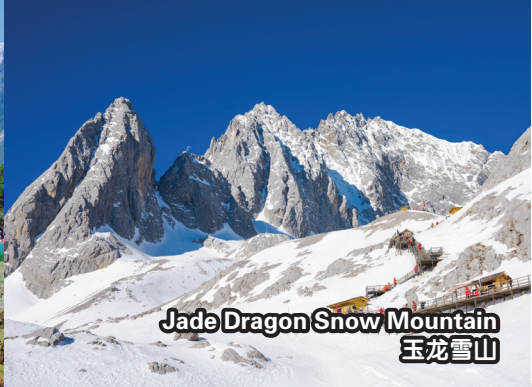
Jade Dragon Snow Mountain 玉龙雪山