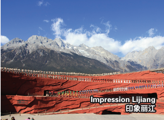
Impression Lijiang 印象丽江