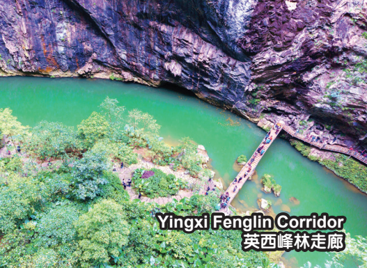
Yingxi Fenglin Corridor 英西峰林走廊