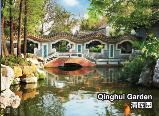
Qinghui Garden 清晖园