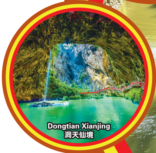
Dongtian Xianjing 洞天仙境