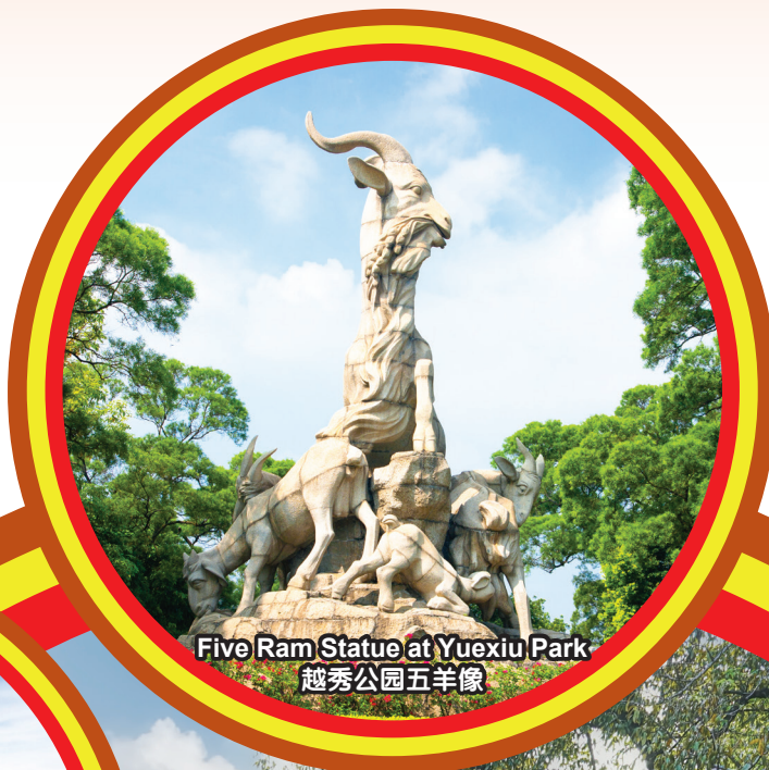
Five Ram Statue at Yuexiu Park 越秀公园五羊像

Free sightseeing: Wax Museum, Typhoon Museum