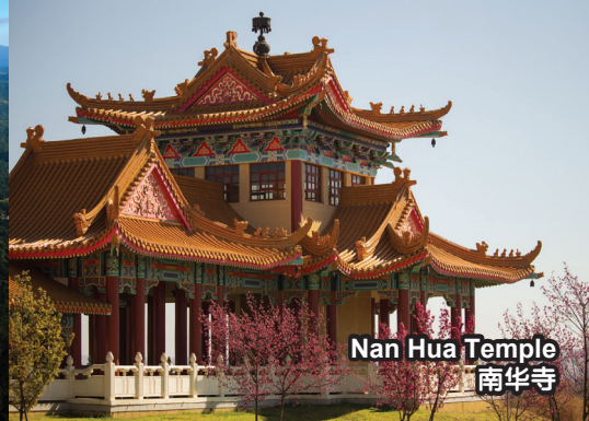
Nan Hua Temple 南华寺