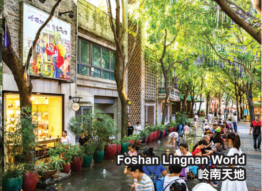
Foshan Lingnan World 岭南天地