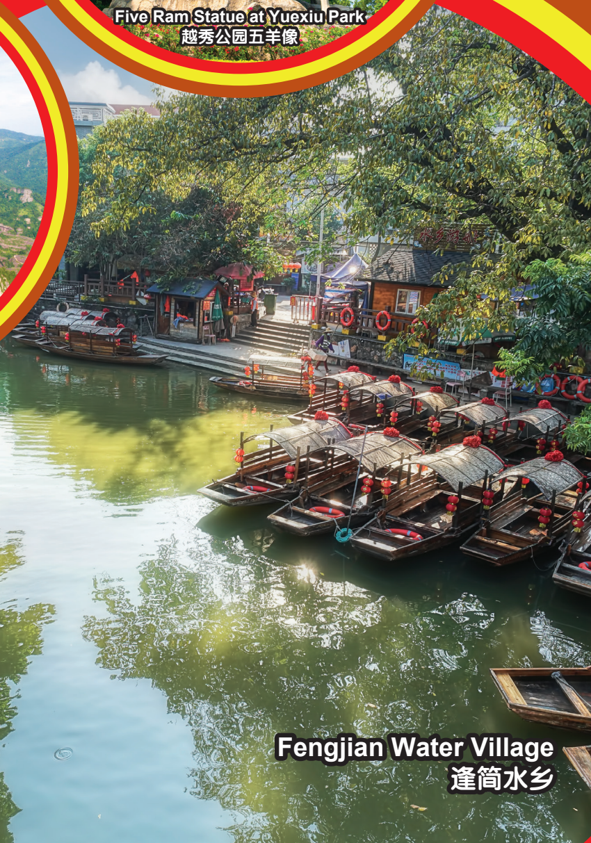
Fengjian Water Village 逢简水乡

行程次序，以当地旅社安排为准。 Sequences of Itinerary are subject to local arrangement.