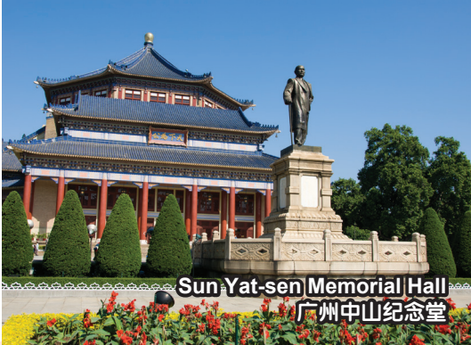
Sun Yat-sen Memorial Hall 广州中山纪念堂