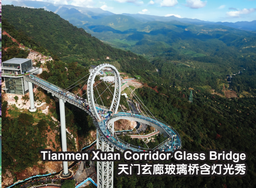
Tianmen Xuan Corridor Glass Bridge 天门玄廊玻璃桥含灯光秀