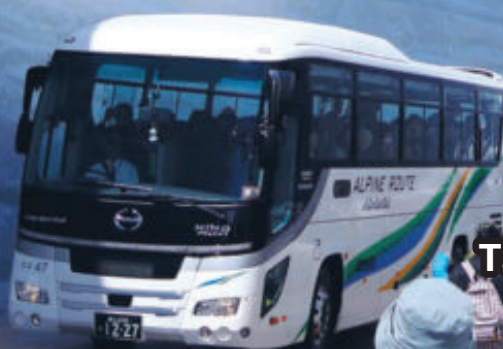
Tateyama Kurobe Alpine 立山黒部【雪の大谷】

行程次序，以当地旅社安排为准。 Sequences of Itinerary are subject to local arrangement.