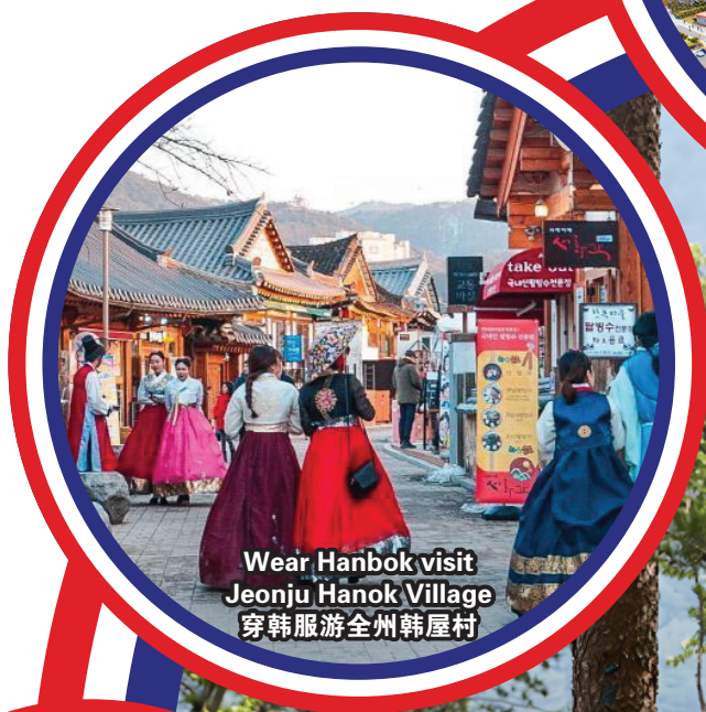
Wear Hanbok visit Jeonju Hanok Village 穿韩服游全州韩屋村