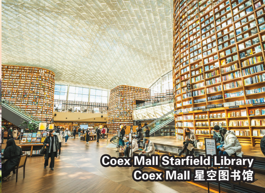
Coex Mall Starfield Library Coex Mall 星空图书馆