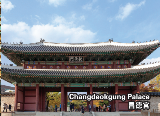
Changdeokgung Palace 昌德宫