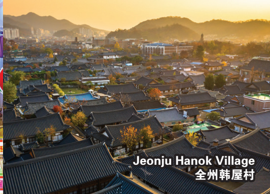
Jeonju Hanok Village 全州韩屋村