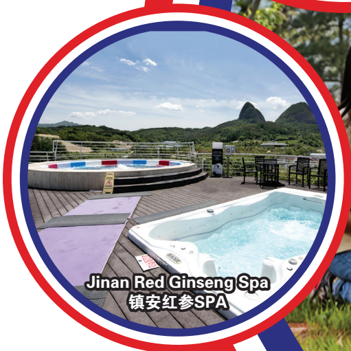
Jinan Red Ginseng Spa 镇安红参SPA