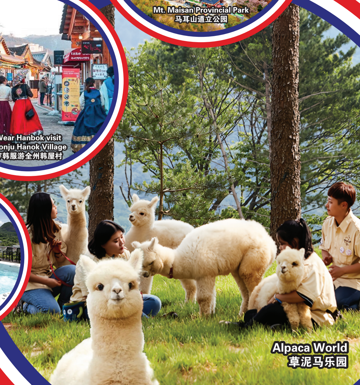
Alpaca World 草泥马乐园

行程次序，以当地旅社安排为准。 Sequences of Itinerary are subject to local arrangement.