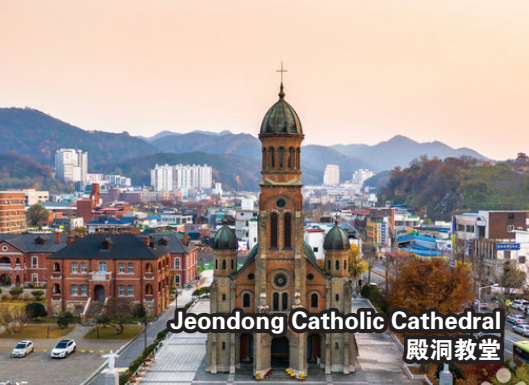
Jeondong Catholic Cathedral 殿洞教堂