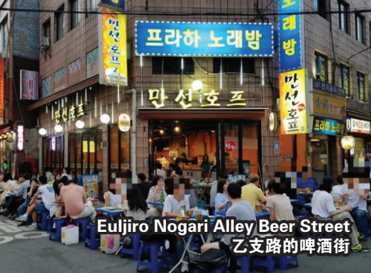
Euljiro Nogari Alley Beer Street 乙支路的啤酒街