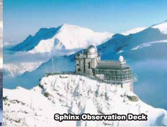
Sphinx Observation Deck