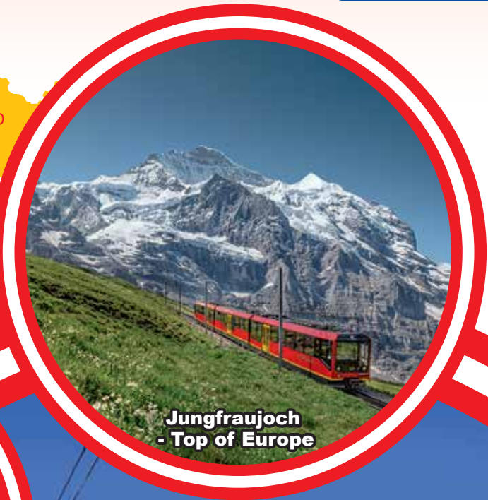
Jungfrauoch - Top of Europe