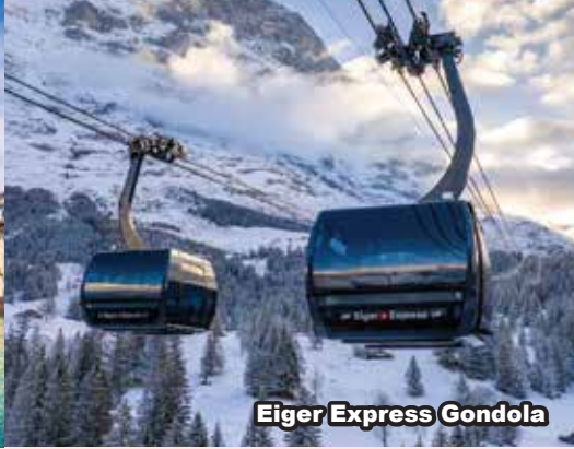
Eiger Express Gondola