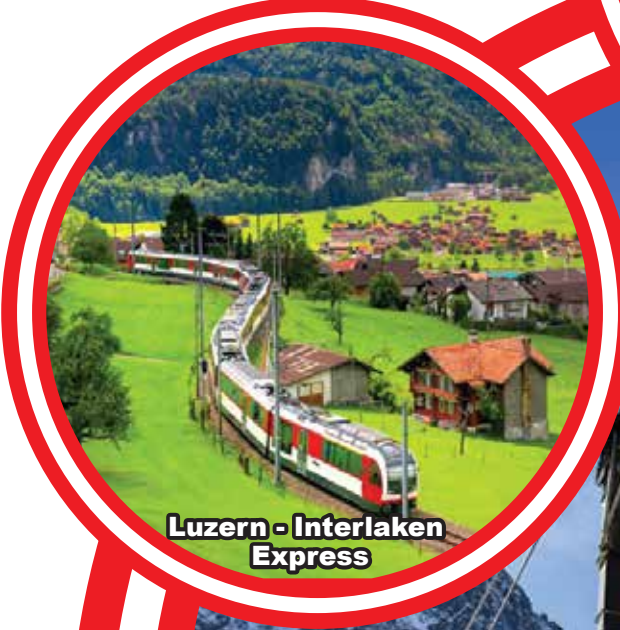
Luzern - Interlaken Express