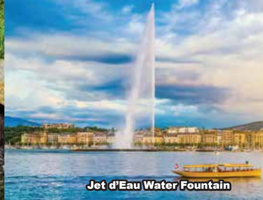
Jet d'Eau Water Fountain