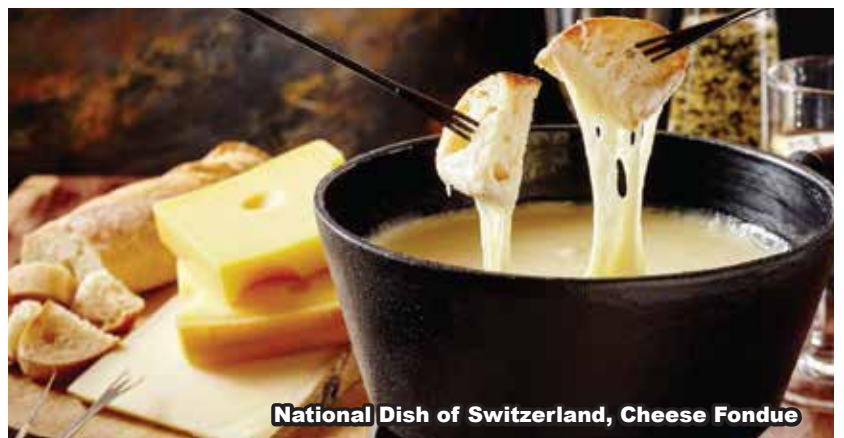
National Dish of Switzerland, Cheese Fondue