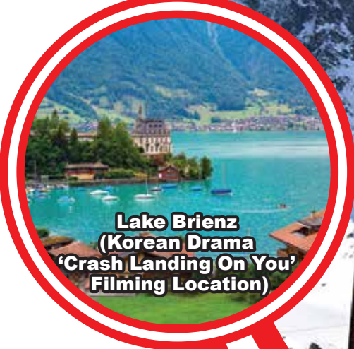
Lake Brienz (Korean Drama 'Crash Landing On You' Filing Location)