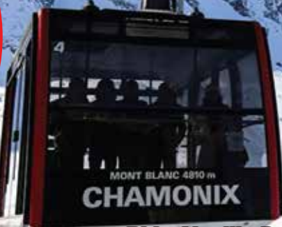
Ride Aiguille Du Midi Cable Car to view Mont Blanc