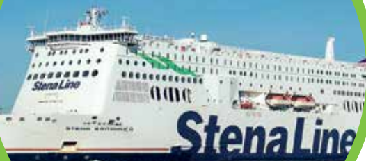
Stena Line (Overnight Cruise London to Amsterdam)