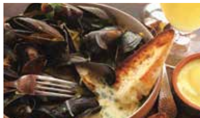
3 Course Meal –Mussels Meals