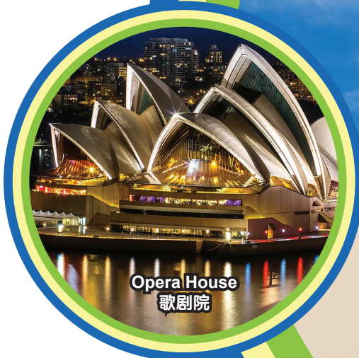
Opera House 歌剧院