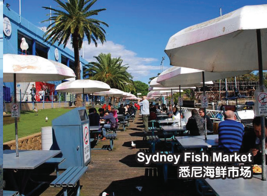
Sydney Fish Market 悉尼海鲜市场