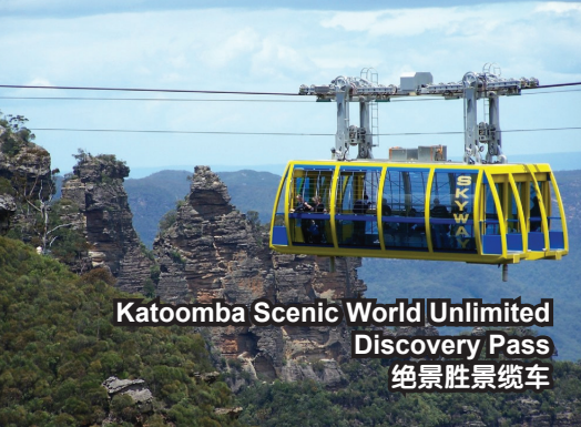
Katoomba Scenic World Unlimited Discovery Pass 绝景胜景缆车