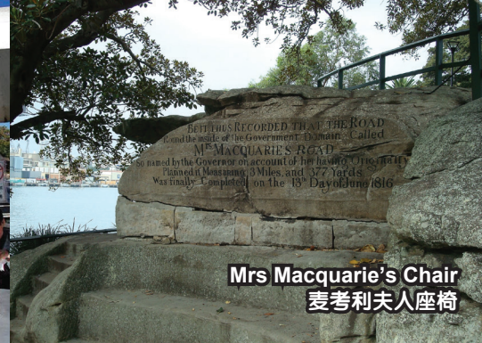
Mrs Macquarie's Chair 麦考利夫人座椅