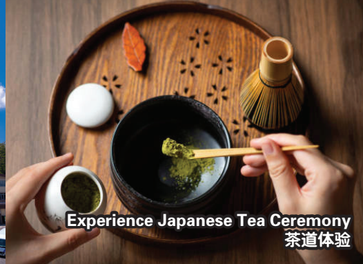
Experience Japanese Tea Ceremony 茶道体験