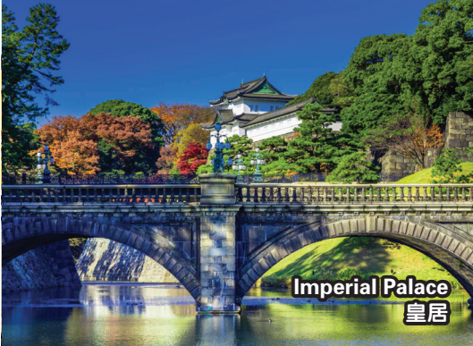
Imperial Palace 皇居