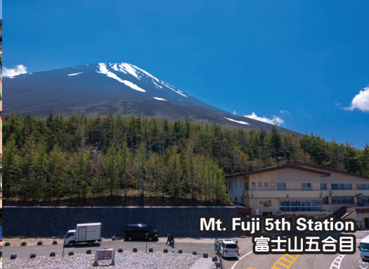
Mt. Fuji 5th Station 富士山五合目