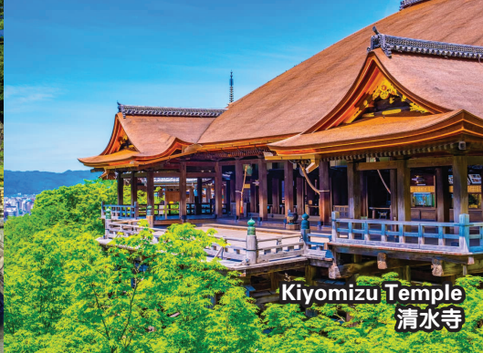
Kiyomizu Temple 清水寺