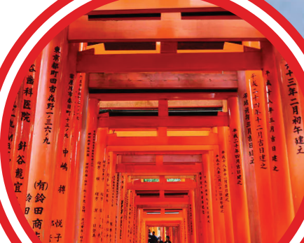
Fushimi Inari Taisha 伏见稻荷大社