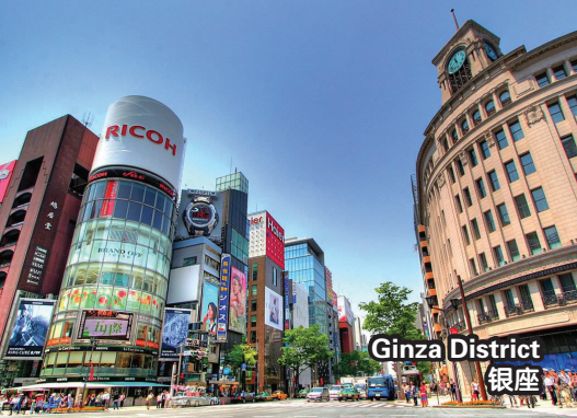
Ginza District 銀座