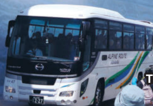
Tateyama Kurobe Alpine 立山黑部【雪の大谷】

行程次序，以当地旅社安排为准。 Sequences of Itinerary are subject to local arrangement.