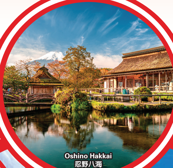
Oshino Hakkai 忍野八海