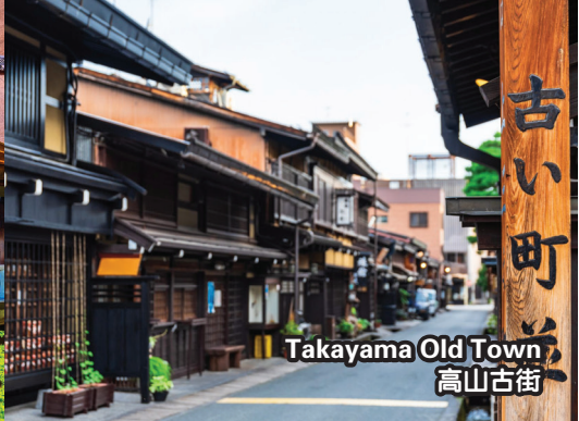
Takayama Old Town 高山古街