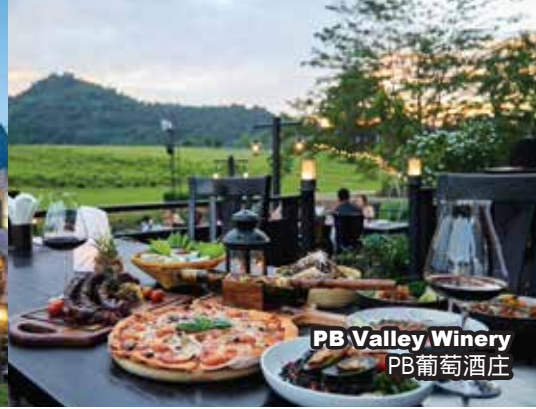
PB Valley Winery PB葡萄酒庄