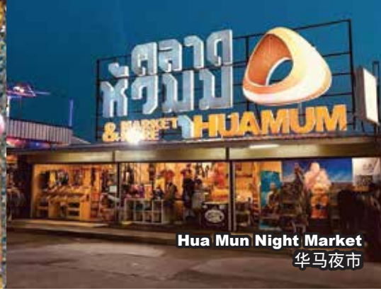
Hua Mun Night Market 华马夜市