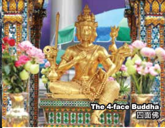
The 4-face Buddha 四面佛