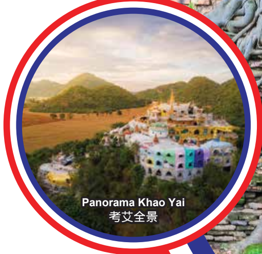
Panorama Khao Yai 考艾全景