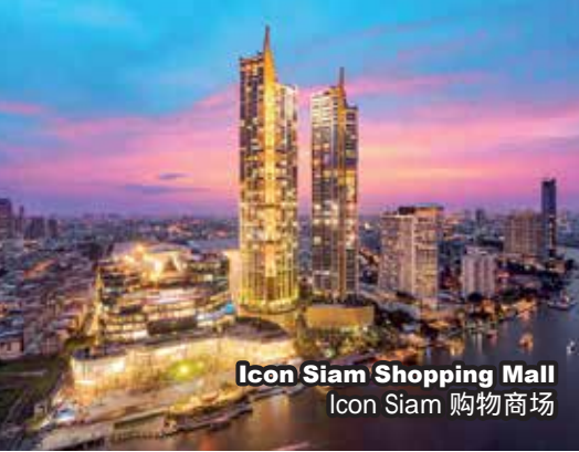
Icon Siam Shopping Mall Icon Siam 购物商场