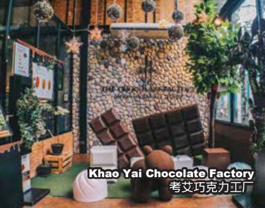
Khao Yai Chocolate Factory 考艾巧克力工厂