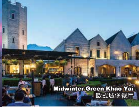
Midwinter Green Khao Yai 欧式城堡餐厅