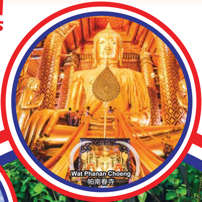
Wat Phanan Choeng 帕南春寺