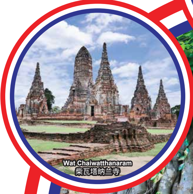
Wat Chaiwatthanaram 柴瓦塔纳兰寺