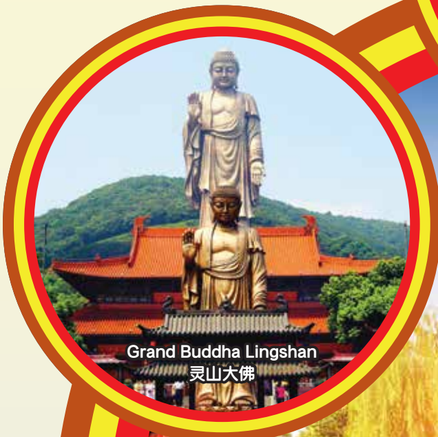
Grand Buddha Lingshan 灵山大佛