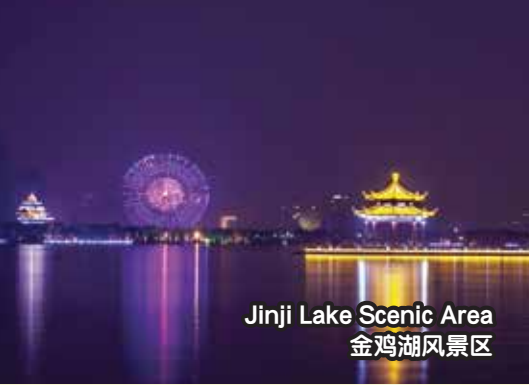
Jinji Lake Scenic Area 金鸡湖风景区