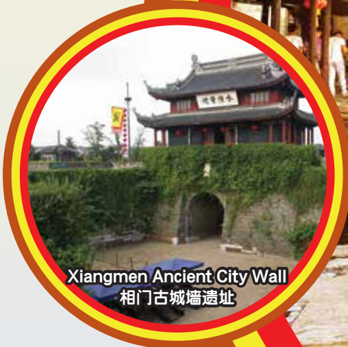
Xiangmen Ancient City Wall 相门古城墙遗址