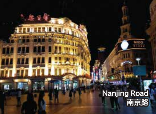
Nanjing Road 南京路