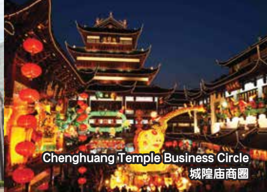
Chenghuang Temple Business Circle 城隍庙商圈