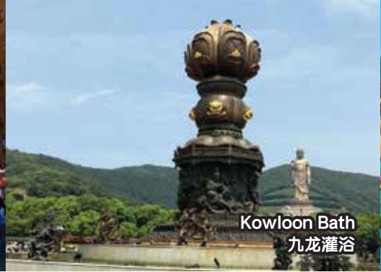
Kowloon Bath 九龙灌浴