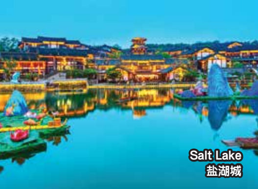
Salt Lake 盐湖城