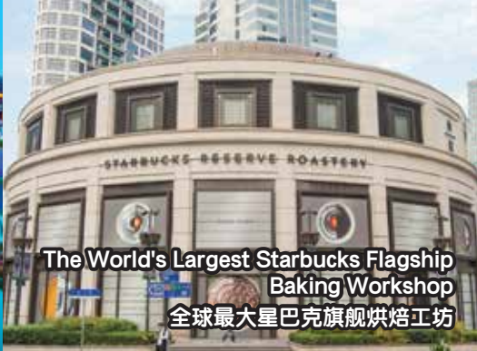
The World's Largest Starbucks Flagship Baking Workshop 全球最大星巴克旗舰烘焙工坊