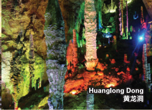
Huanglong Dong 黄龙洞