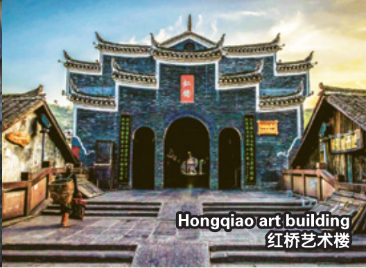
Hongqiao art building 红桥艺术楼