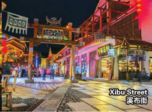
Xibu Street 溪布街