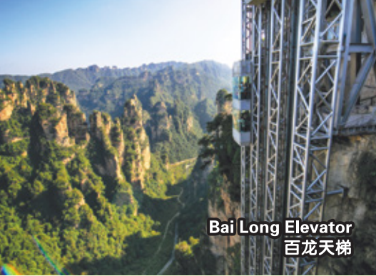
Bai Long Elevator 百龙天梯