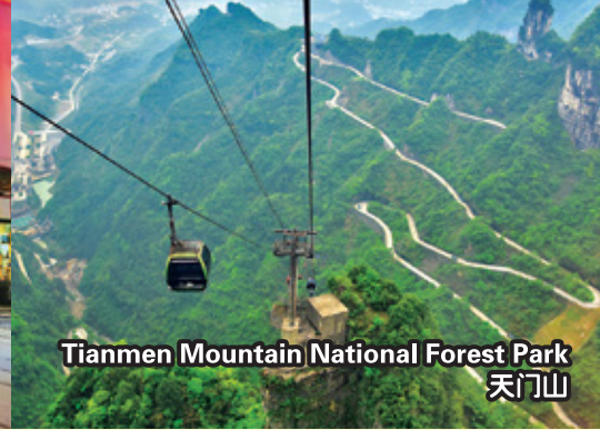
Tianmen Mountain National Forest Park 天门山