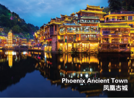
Phoenix Ancient Town 凤凰古城