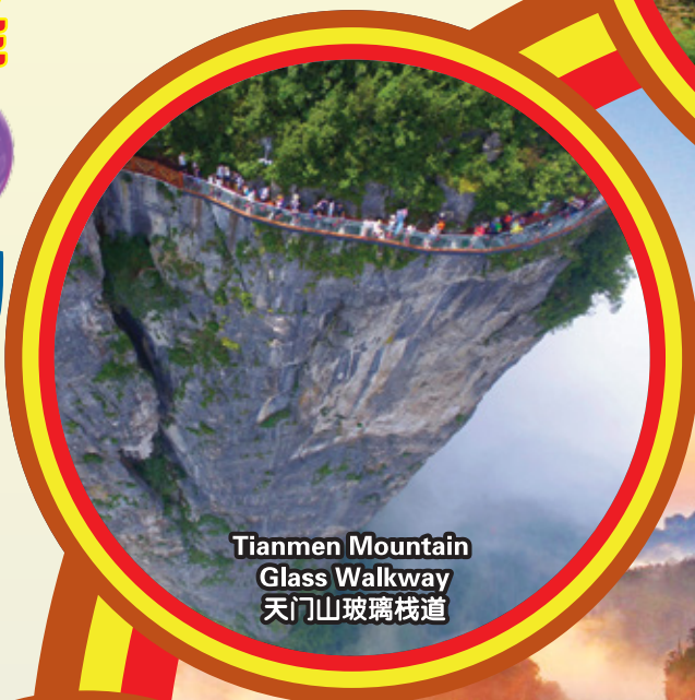
Tianmen Mountain Glass Walkway 天门山玻璃栈道