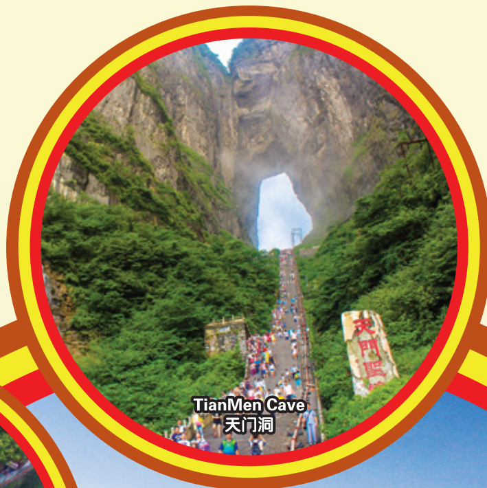
TianMen Cave 天门洞