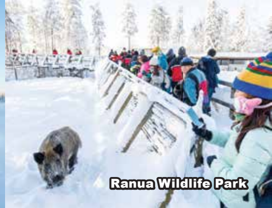
Ranua Wildlife Park