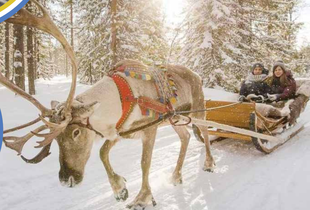
Reindeer Sleigh Ride