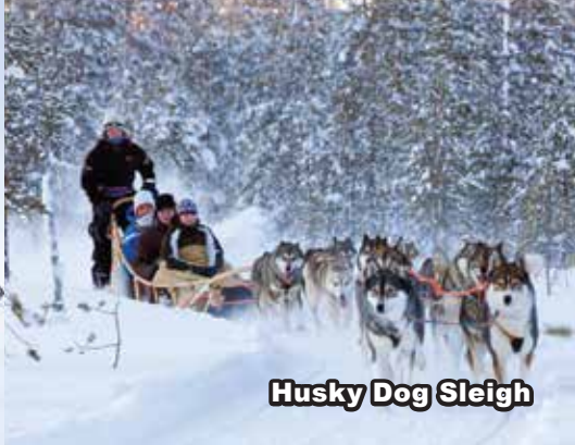
Husky Dog Sleigh