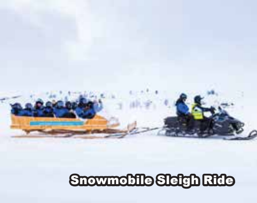
Snowmobile Sleigh Ride