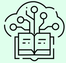
Managing Logistics and Supply (Digital Learning)