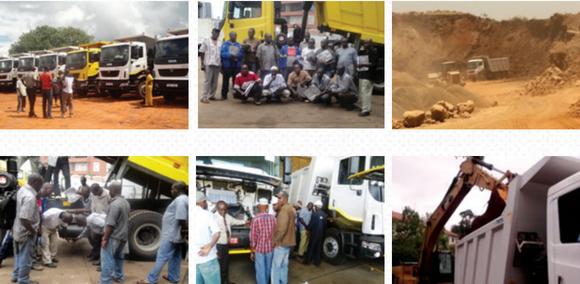
Prima – On Site Campaign/Support

Prima has been Tata Motors Flagship Product launched in Africa Market comes with excellent support of Dealer Network with over 40 number of workshops in Africa equipped with state of the art Workshop machinery, Tata trained Technical team and an adequate stock of parts to service our Customers. Prima comes with an Industry unique warranty of 400000 kms or 3 years whichever comes earlier with a service interval of 10000 kms which reduces overall vehicle uptime in Workshop.