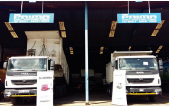
Prima Dedicated – Kenya...