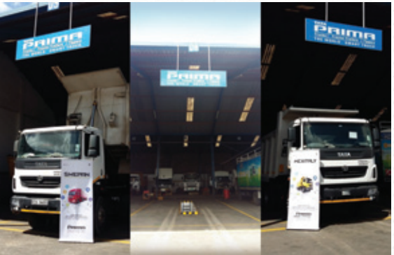
Dedicated Bays with Service Pit

In view of our Customer requirements in certain offsite locations where the Prima Trucks have to run 24X7, Customer's team is trained on site for handling service related issues & for Customer's Managerial staff a feature based training is done for general knowhow and maintenance. Keeping in view of various applications our Customers are using Prima Tata Motors provide Roadside assistance in case of a technical emergency with a dedicated 24X7 telephone lines for any query or a concern.