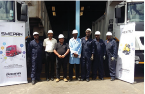
Formation of Prima Team: (M&HCV I/c, Team Leader, 2 Technicians, Electrician and PDI Technician)