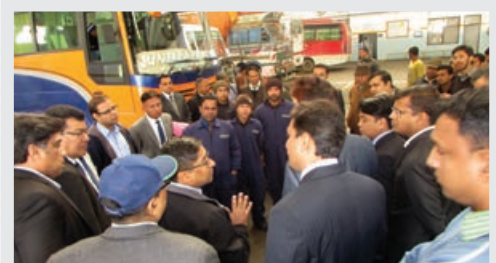
Guidelines to Prima Technicians by TML Senior Officials