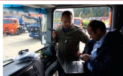
Hand zone training experience for technicians

"To run your product trouble free" is the motto of Tata Motors & their channel partner. Therefore an exclusive manpower of service technicians is trained and certified for Prima Range. This team is dedicated to ensuring continuous support to all Prima Customers and we are making continuous efforts to update the technicians with newer technologies to understand changing customer needs from time to time so that our future products & services exceed customer expectations. But we don't let our customers here, we also give the training to their drivers at the time of product delivery and also On Site Training to familiarize them with product features and drivability.