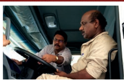
Onsite driver training