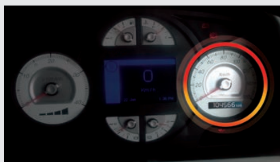
First vehicle in East Africa crossed 100,000 kms mark successfully