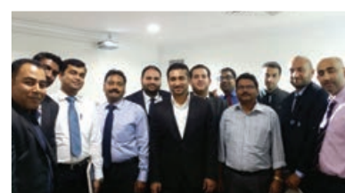
A team of sales manpower in Qatar trained under "TML Sales Champion Initiative"