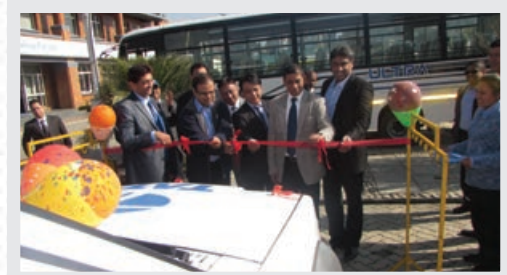
Inauguration of Dedicated Mobile Van by TML Senior Officials