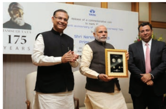
From right: Chairman of Tata Sons, Cyrus P Mistry, Prime Minister of India, Narendra Modi and Minister of State (Finance), Jayant Sinha at the 175 th birth anniversary of Jamsetji Nusserwanji Tata