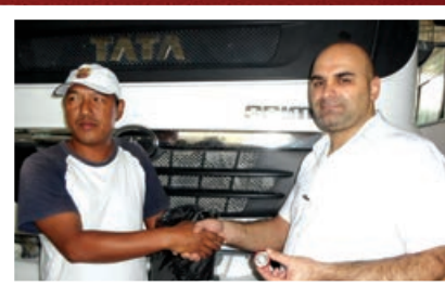
Driver felicitation for completing 100,000 kms in Qatar - Power Waste Management