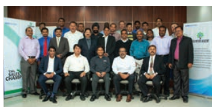
A team of Distributors across the Globe trained in Prima Plant (India) under "TML Sales Champion Initiative"

Focusing on solution selling to suggest the right product for the right application, a TML Sales Champion initiative has been designed to train our Channel partner sales force to assist the customers in making the right product choices. More than 100 participants were trained across the Globe under this initiative.