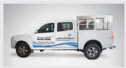
Dedicated Mobile Van in UAE (Dubai) to support you anywhere anytime