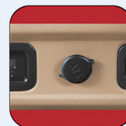
Mobile charger provision