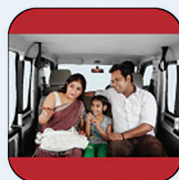
Comfortable passenger cabin