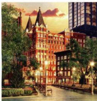
Above: The Beekman hotel, Lower Manhattan