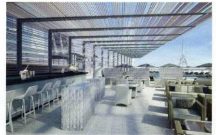
Above: the poolside bar at the Four Seasons Abu Dhabi at Al Maryah Island

© THE BEEKMAN & MORRIS ISLAND, VISOR LIMITED EDITOR