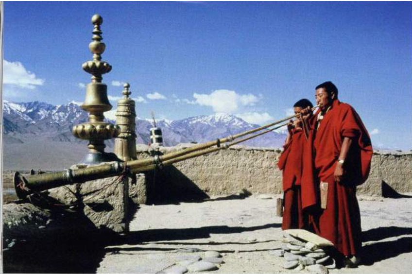
Above: Shakti's new River House offers the opportunity to commune with monks in the Himalayas. Below: the drawing room at Palé Hall hotel, just outside Snowdonia National Park in Wales

Tom Colicchio and Keith McNally – whose Odeon restaurant, just up West Broadway (itself once again a nexus of cool), more or less put downtown on the map almost 40 years ago.