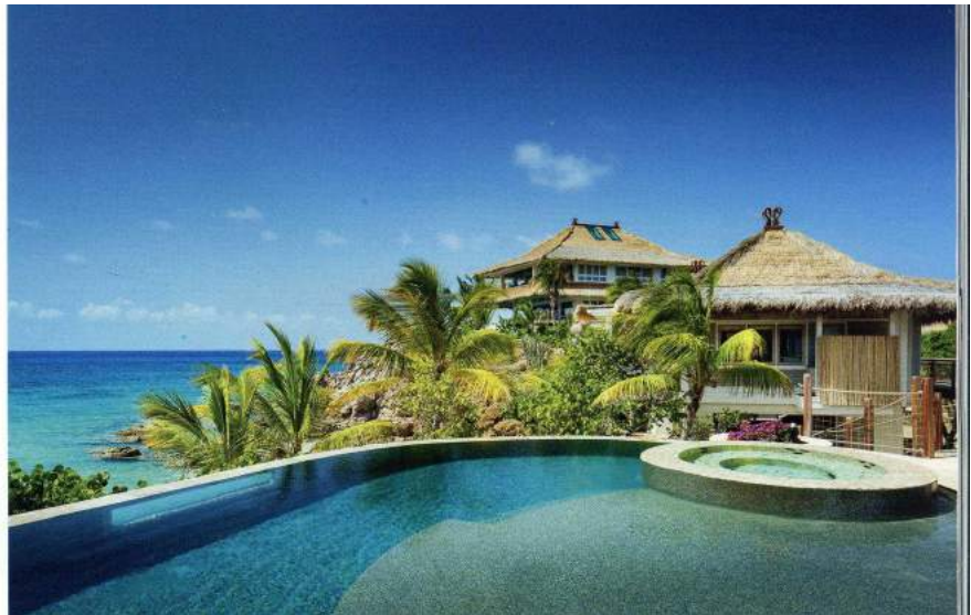
Above: the infinity pool at the Beach Villa on Moskito Island in the British Virgin Islands. Below: the Rooftop Suite at the Katamama hotel on Seminyak beach, Bali

→ In NEW YORK , Lower Manhattan's renaissance continues: media giant Time Inc has followed Condé Nast's lead and relocated downtown, and with such a dense concentration