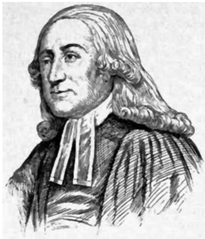
Rev. John Wesley

John Wesley 1 , priest in the Church of England who was the inspiration and founder of the Methodist movement. The name “Wesleyan” is in honour of Rev. John Wesley. It was their disciplined routine (or method) of spiritual devotion that earned Wesley and a few of his friends in ministry the nickname “Methodists” beginning in 1735. The name stuck later to the unique new organizational structure Wesley designed to provide prayer and spiritual care for tens of thousands of converts who found Christ through their work.