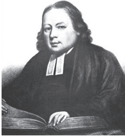
Dr. Thomas Coke

India, and unfortunately he died during his first voyage to India. A prolific writer, he was an author of Commentary on the Old and New Testaments , 5 – volumes (1801–03); A History of the West Indies (1808–11); several volumes of sermons; and the Life of John Wesley (with Henry Moore; 1792). Coke ardently opposed slavery.