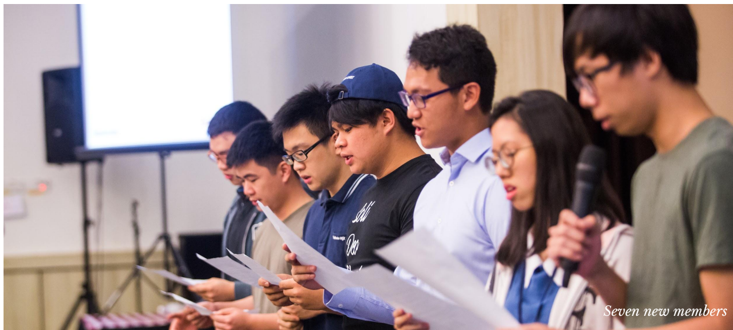
Seven new members

During camp, we celebrated the addition of seven new members to the church family as they made the decision to grow and uphold the holiness of the church together as a united body. We thank God for more who are striving to make the same commitment toward the building up of the body of Christ.