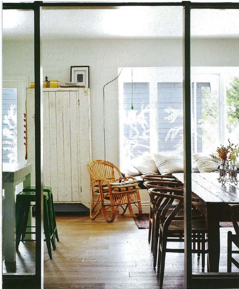
Above: The light-filled dining space is full of eclectic vintage market finds, creating a warm family interior. Below: The bay window banquette in the living space is the perfect spot for reading a book, or simply a cosy place to relax for all members of the family.