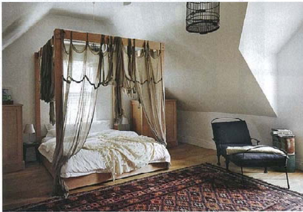
Above: An opulent king-sized four-poster bed, complete with decadent netting, has pride of place in the master bedroom. A bird cage is used as a light fixture. Right: A free-standing bath adds another touch of luxury to the master bedroom. Below: The Martinos enjoy an alfresco lunch in their courtyard.