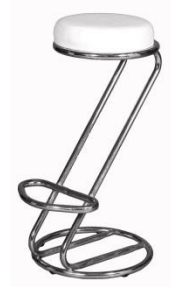
Counter Barstool BS11E (White/Black) 360W x 540D x 730H mm