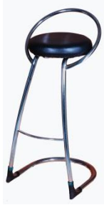
Barstool BS10 (Black) 460W x 480D x 990H mm