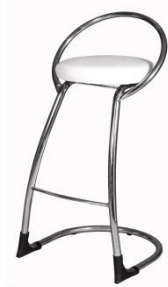
Barstool BS10A (Off-White) 460W x 480D x 990H mm