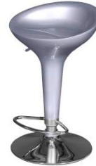
Barstool BS16D Max: 490W x 860H mm Min: 400W x 660H mm