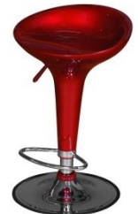
Barstool BS16E Max: 490W x 860H mm Min: 400W x 660H mm