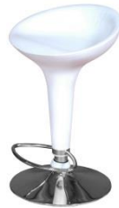
Barstool BS16C 490W x 860H mm 400W x 660H mm