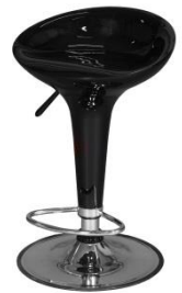
Barstool BS16A Max: 490W x 860H mm Min: 400W x 660H mm