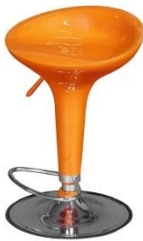
Barstool BS16B Max: 490W x 860H mm Min: 400W x 660H mm