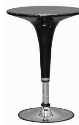
Bistro Table BT07 Max: 600Øx860Hmm Min: 600Øx710Hmm