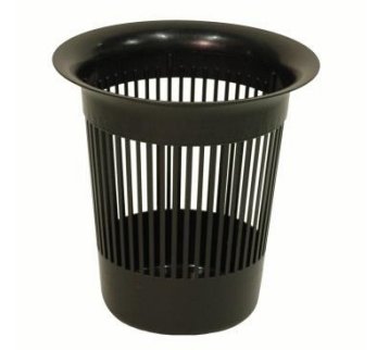
Wastepaper Bin EW01