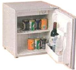
Bar Fridge EE02