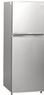
Large Fridge EE01