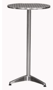
Aluminium Bistro Table BT01A 600D x 1150H mm